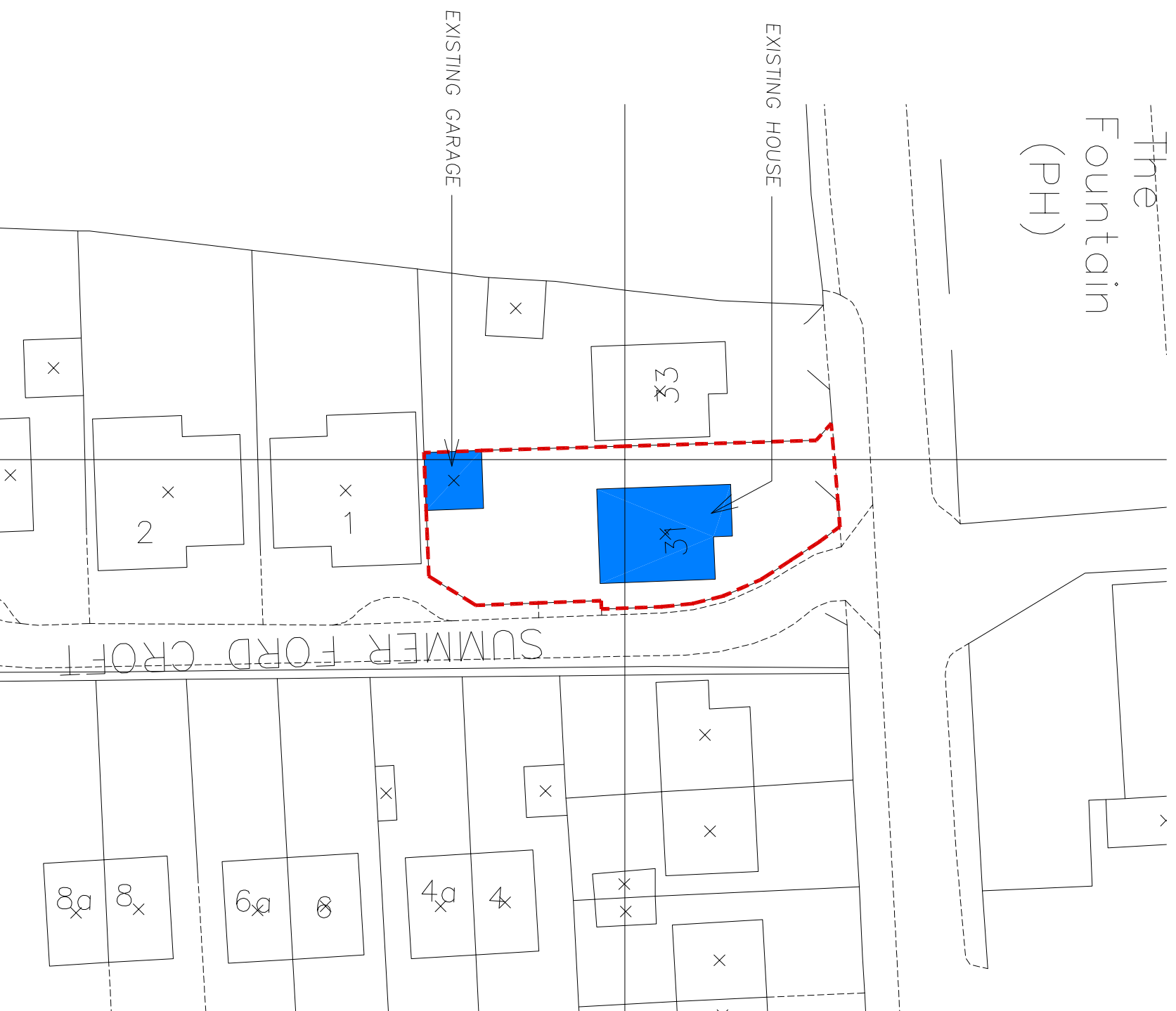
BLOCK PLAN SCALE: 1:500