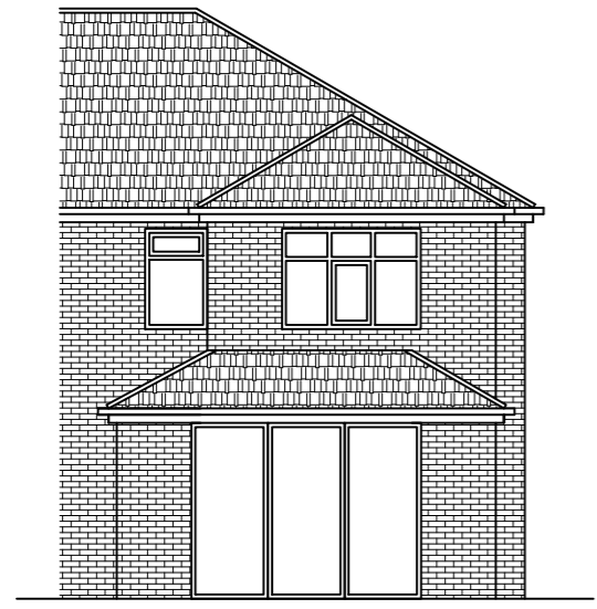
PROPOSED REAR ELEVATION SCALE 1:100 AT A3