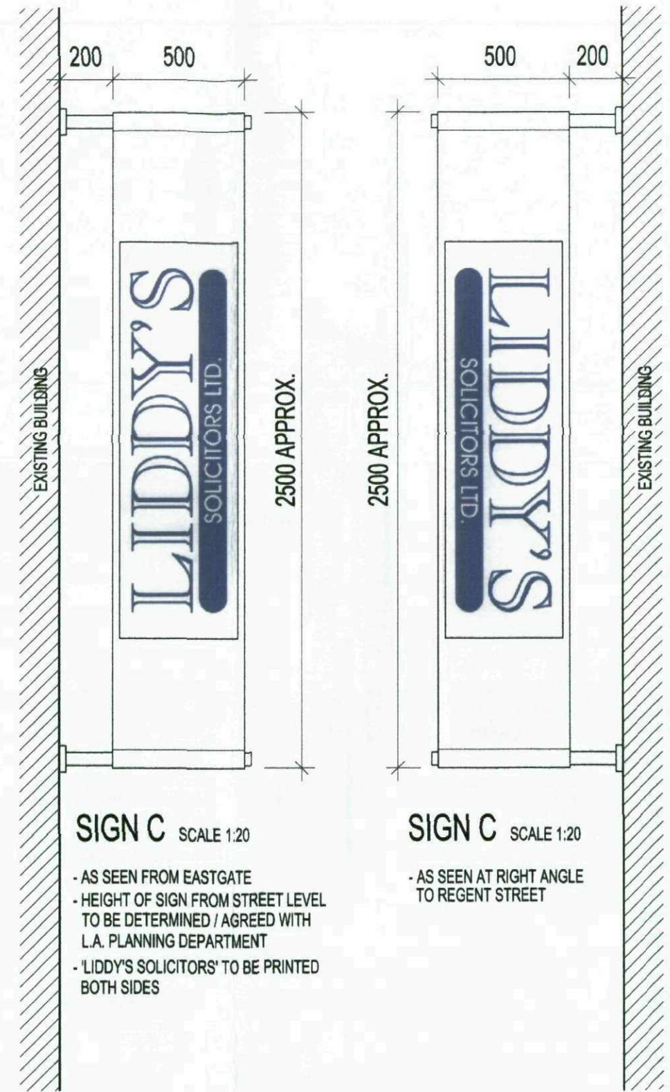
SIGN C SCALE 1:20