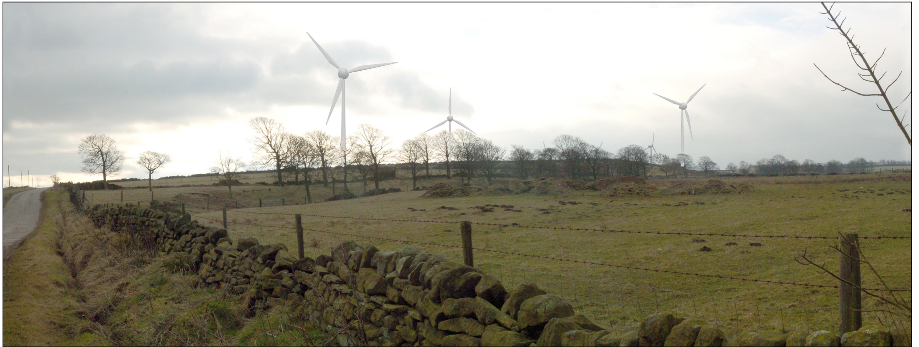
Photomontage showing proposed development from viewpoint