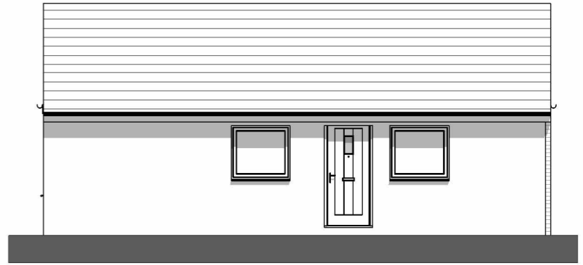
Proposed Left Side Elevation 1 : 100