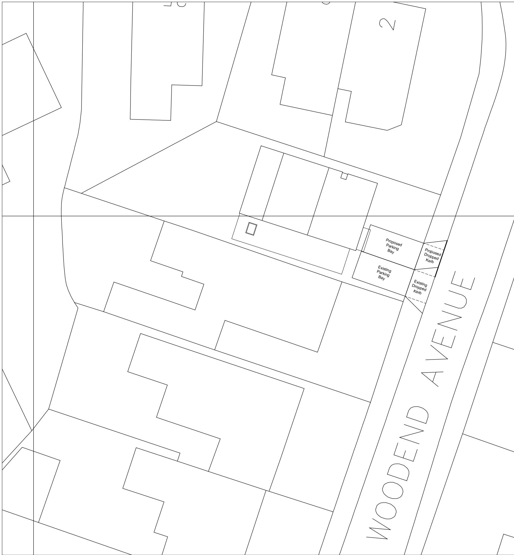
BLOCK PLAN 1:200

A 13/11/24 Block Plan corrected SD SD / 05/11/24 Inaugural Issue SD SD