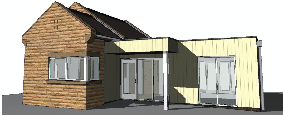
Staff Welfare & Communal Facilities - Perspective View