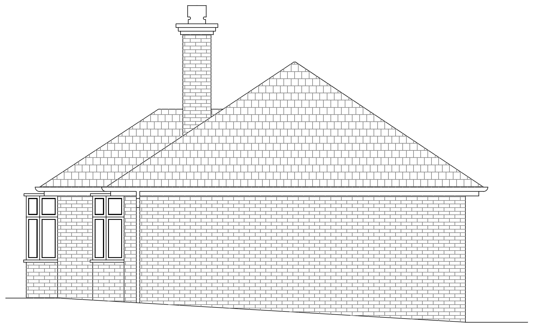
SIDE ELEVATION 1:50