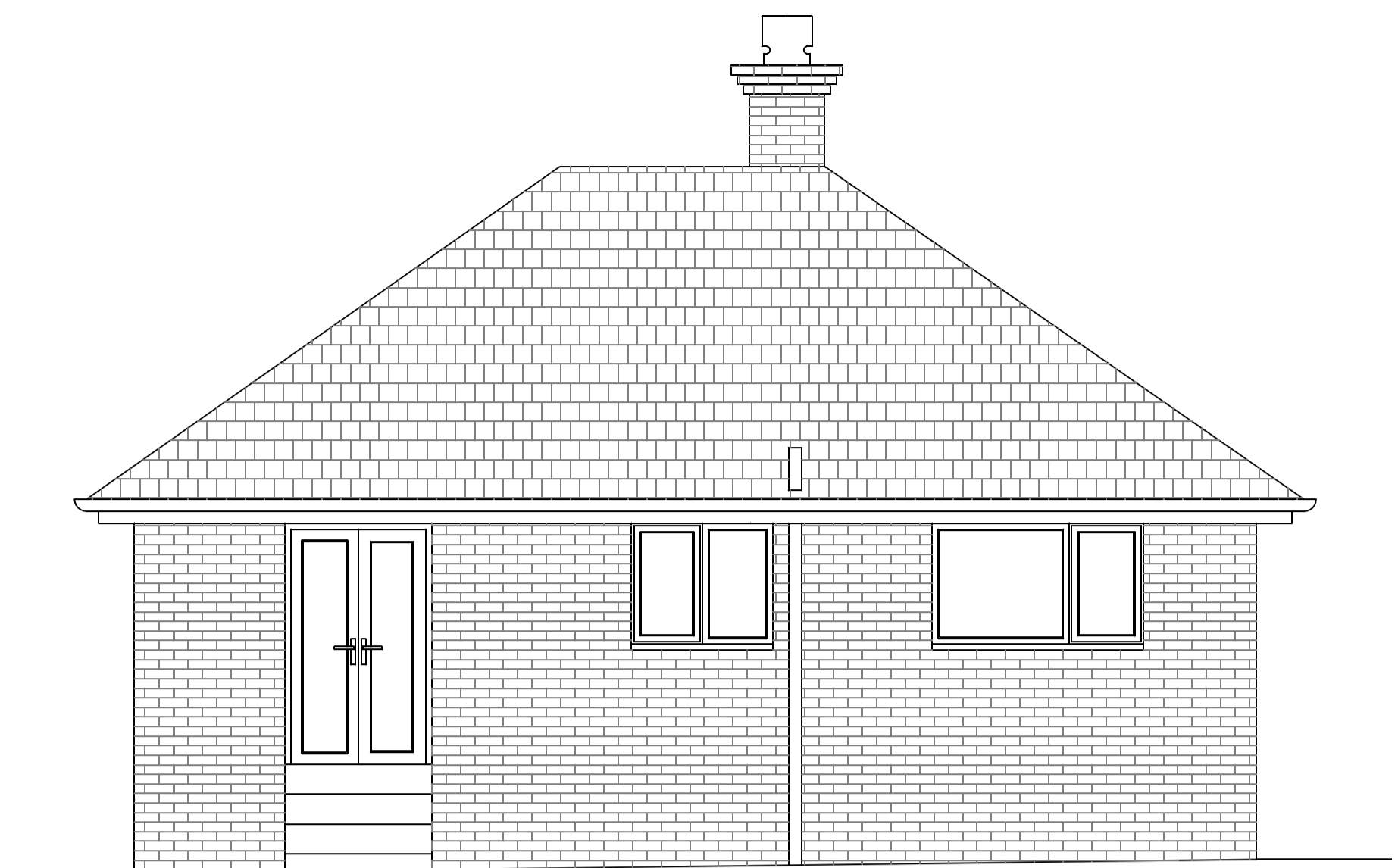
REAR ELEVATION 1:50