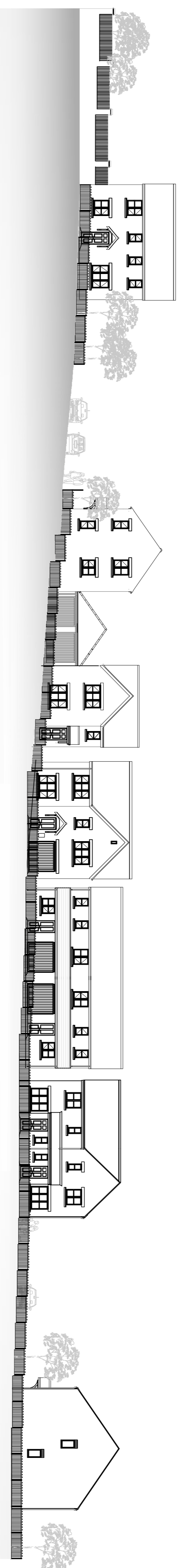
STREET SCENE 2 - PLOTS 1, 35-40, 43& 46