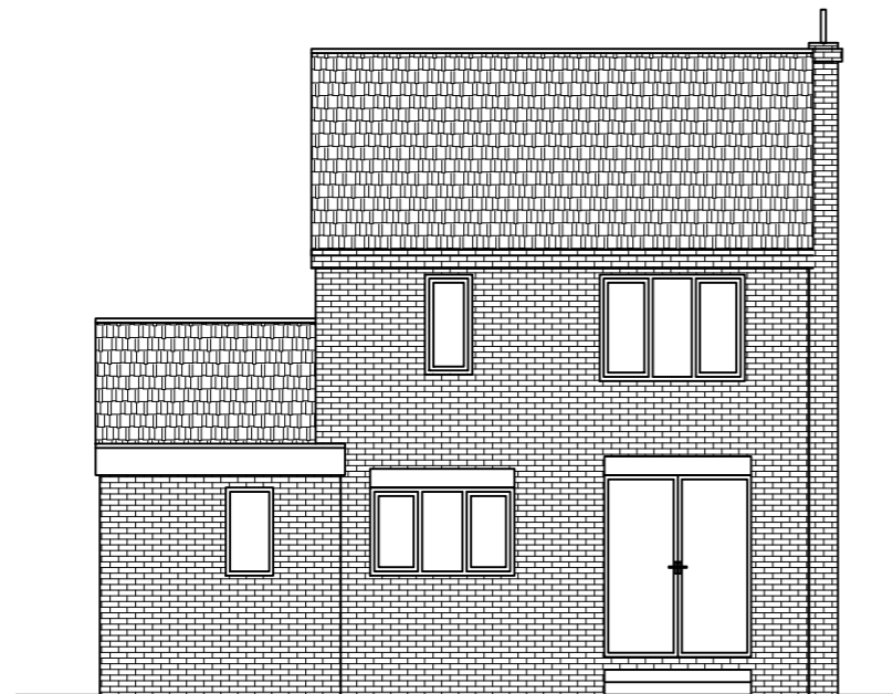
EXISTING REAR ELEVATION SCALE 1:100 AT A3