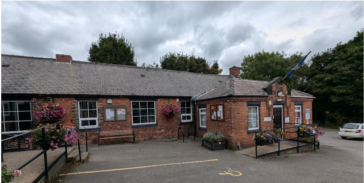
Existing East elevation of St John's Community Centre