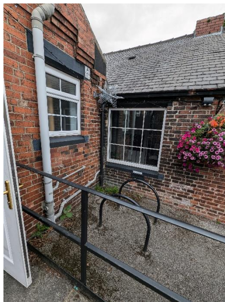
Detail of Existing East elevation of St John's Community Centre

The community centre is currently used as a community space which can be rented from Penistone Town Council (PTC) and hosts many local activity groups. The community centre also houses the administrative offices for PTC's town clerk and hosts PTC meetings. The alterations are being made to improve the fire safety of the community centre.