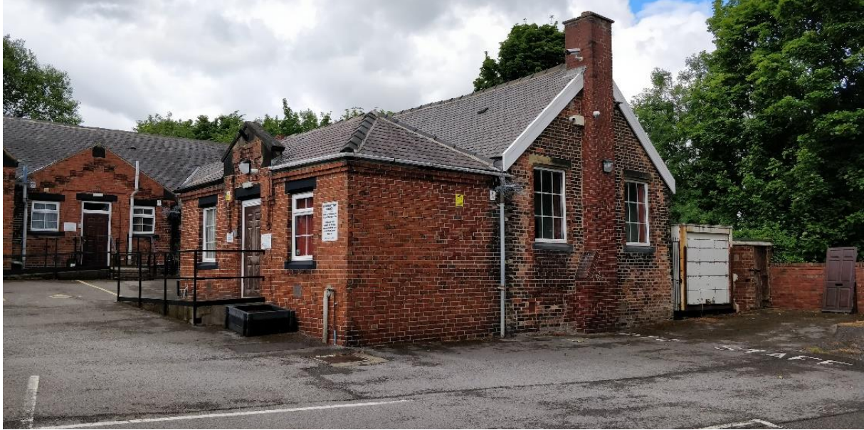
Existing East elevation of St John's Community Centre

Heritage Impact Assessment to accompany application for full planning permission at St.John's Community Centre, Church Street, Penistone, Sheffield, S36 6AR.