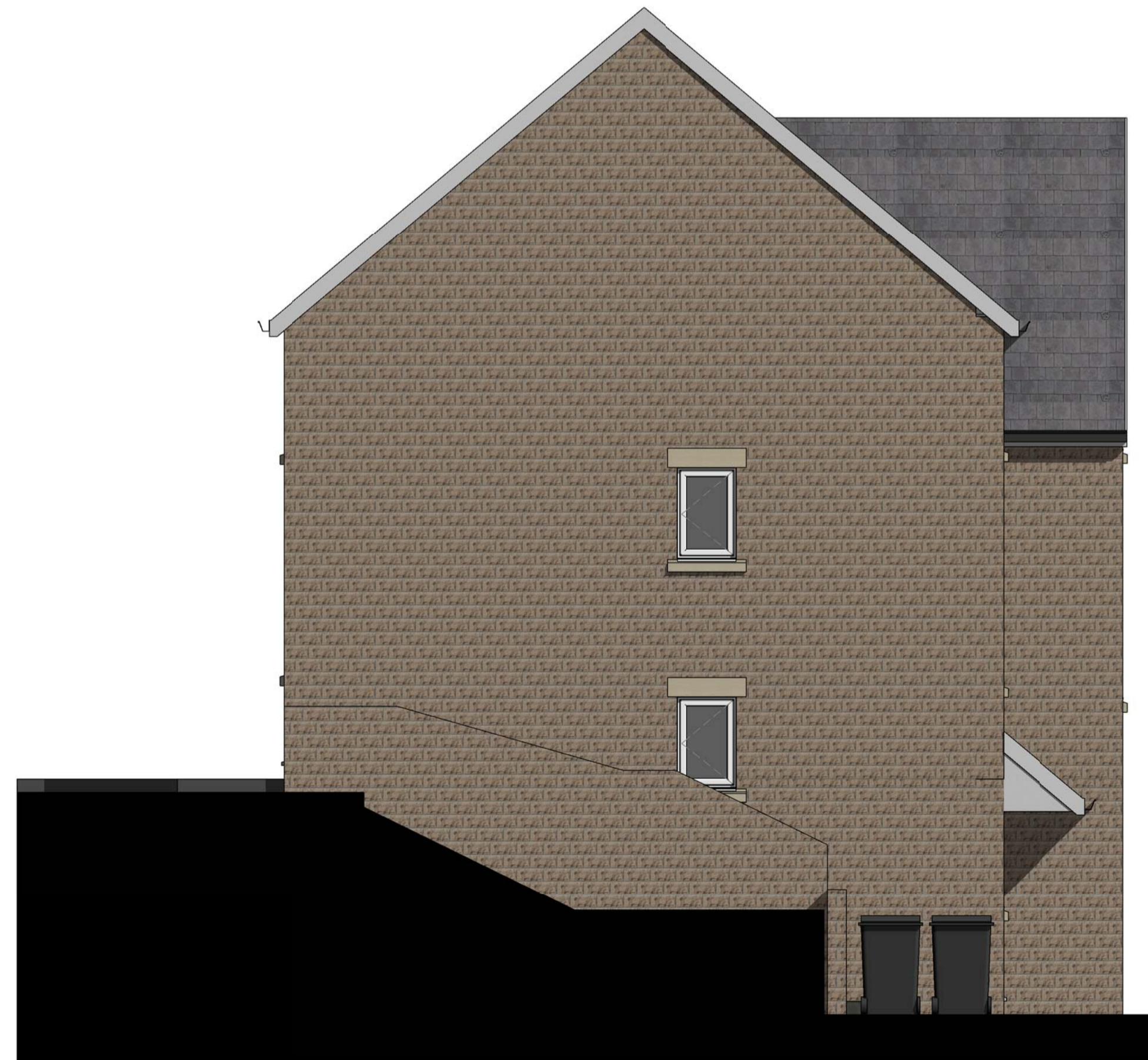
3 East 1 : 50