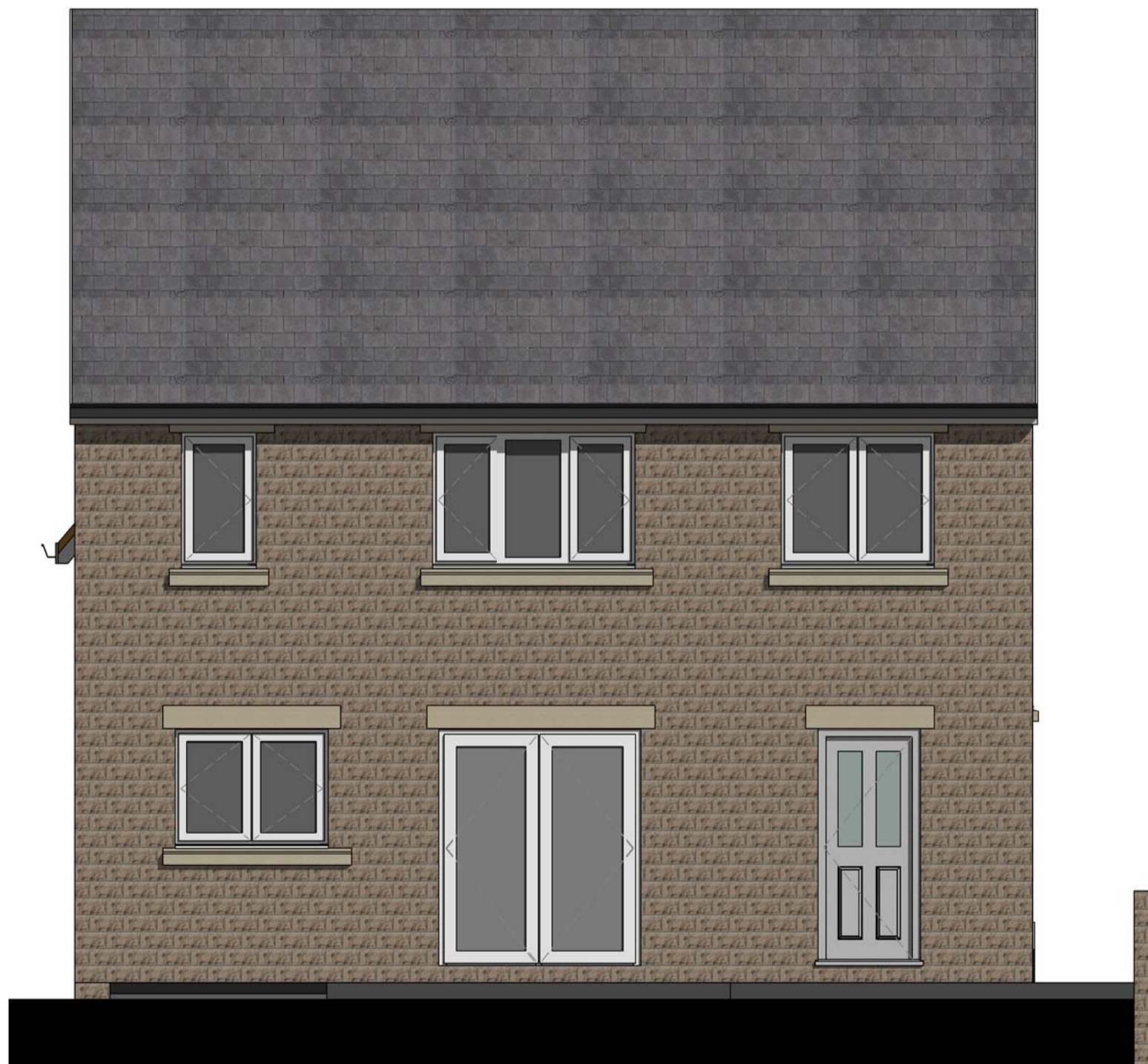
4 South 1 : 50