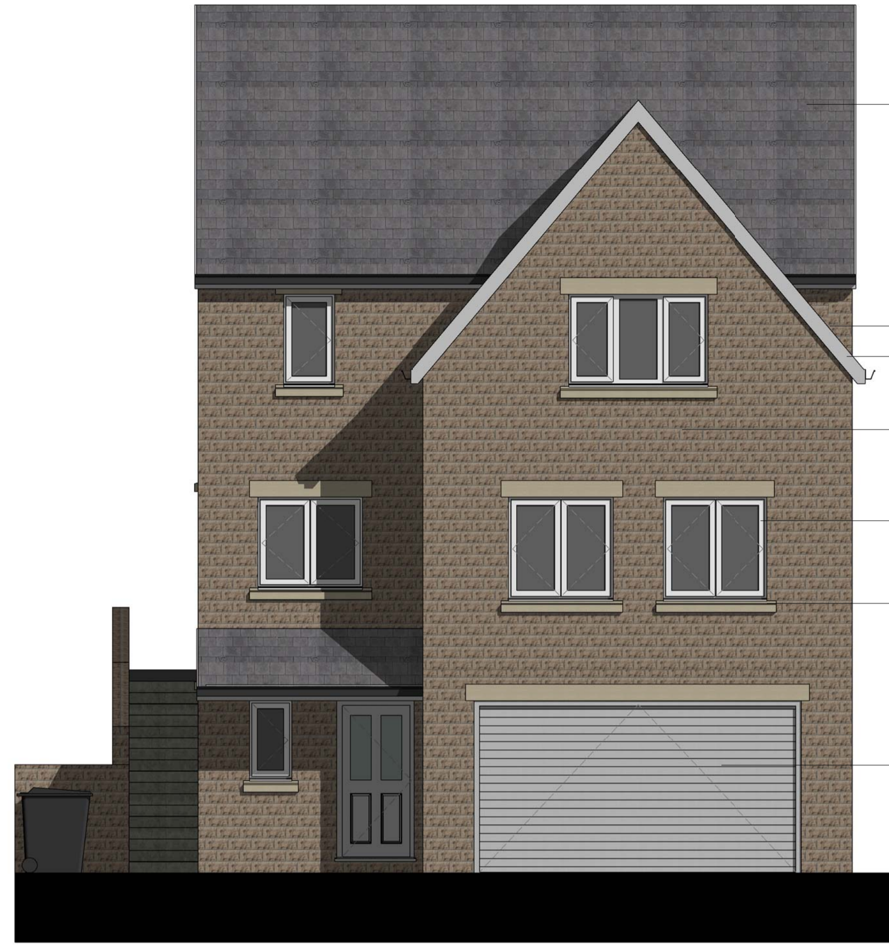
1 North 1 : 50