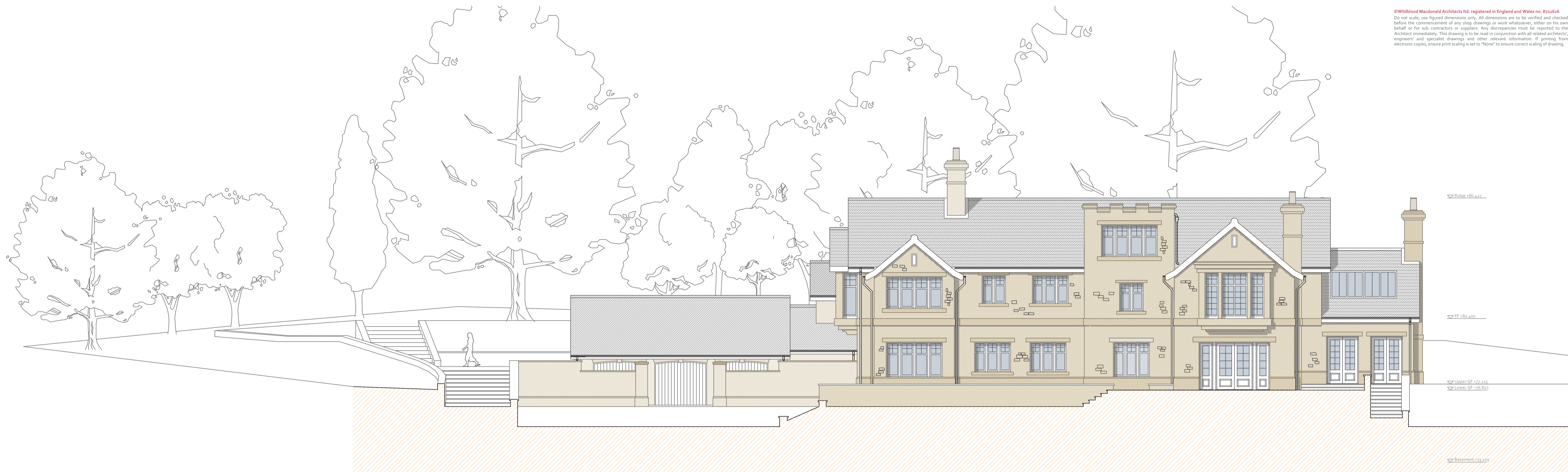
B - Front (South) Elevation