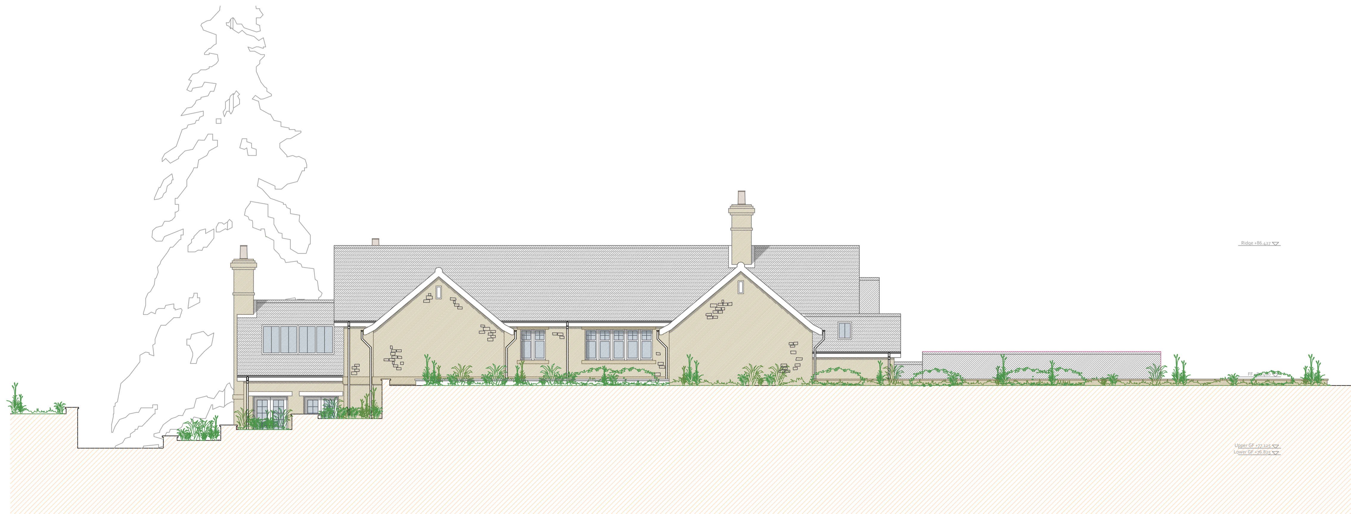
A - Rear (North) Elevation