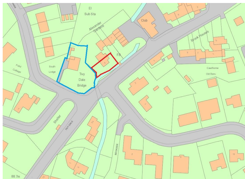
Alexander Gardens in red. South Lodge in Blue.

South Lodge has its South Eastern elevation approximately 14m from no 5 Alexander Gardens at an angle of approximately 45 degrees from the proposed rear extension.