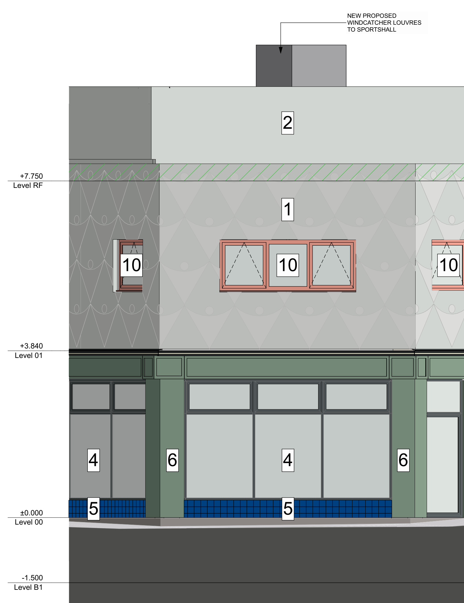
NE ELEVATION 07 1:50