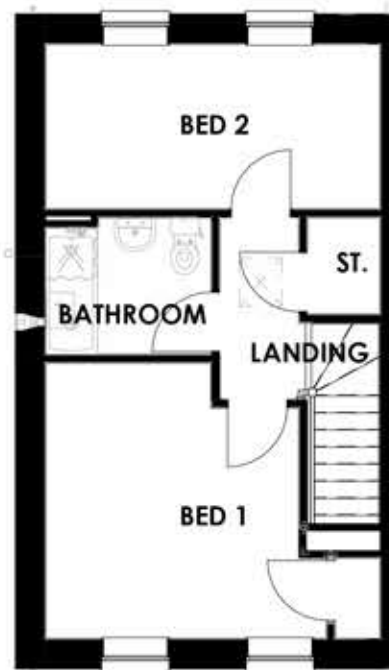
FIRST FLOOR 1 : 100