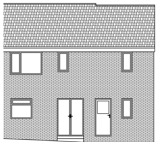
PROPOSED REAR ELEVATION SCALE 1:100 AT A3