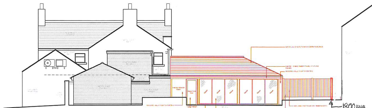
SIDE ELEVATION AS PROPOSED