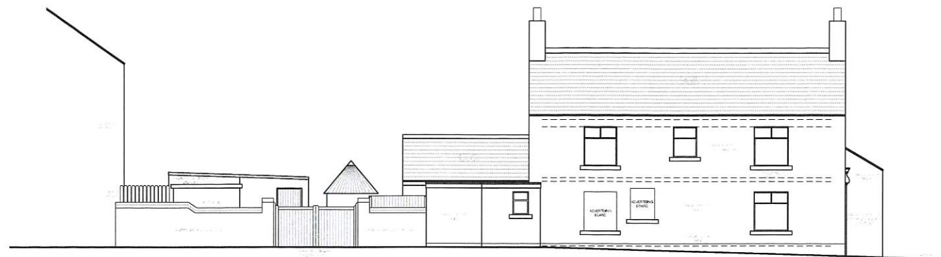
SIDE ELEVATION AS EXISTING

All dimensions to be checked on site prior to work commencing on site. Any discrepancies must be reported to MR+P All dimensions to be checked on site prior to work commencing as this property has not been surveyed by MR+P. Any discrepancies must be reported to MR+P