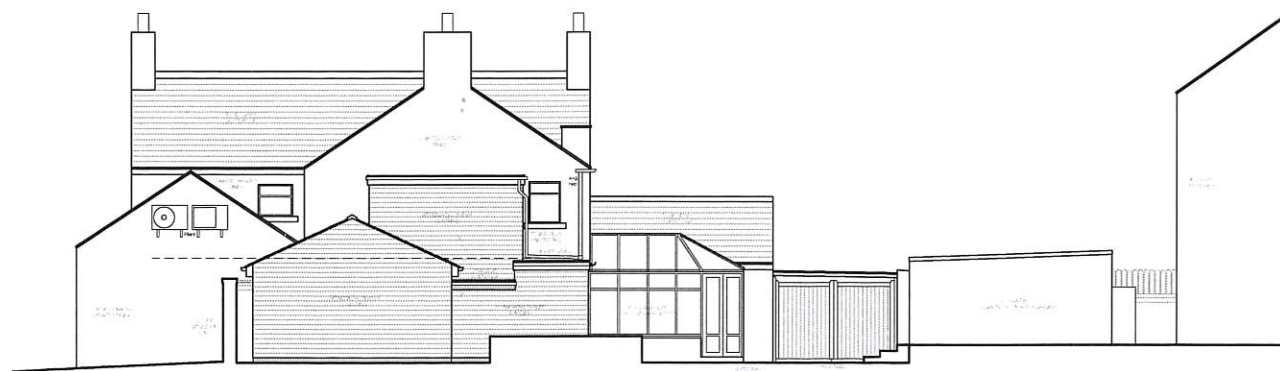
SIDE ELEVATION AS EXISTING