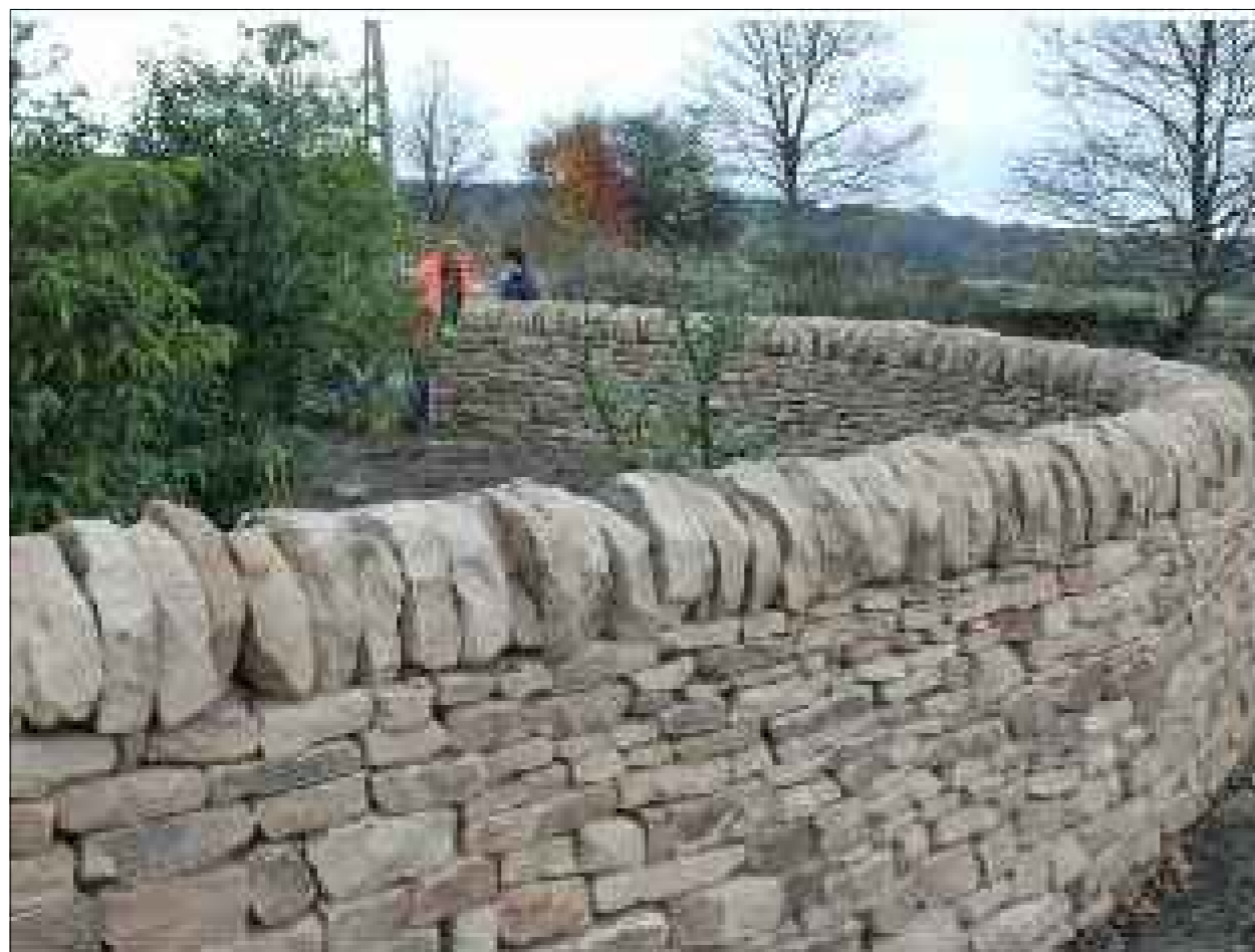
Dry stone walling feature to entrance bellmouths. (behind Visibility Splays) approx 1500 high approx 20m length (each) built using local / reclaimed stone by a Local Stonemason