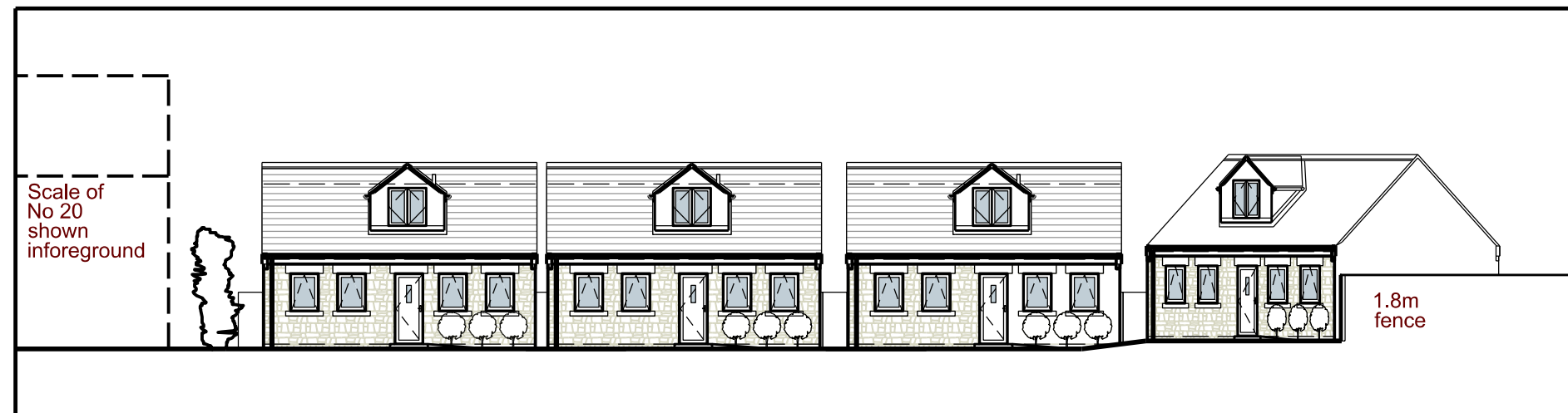
Site Cross Section / Elevation - Proposed 1:200 No1,2,3,4