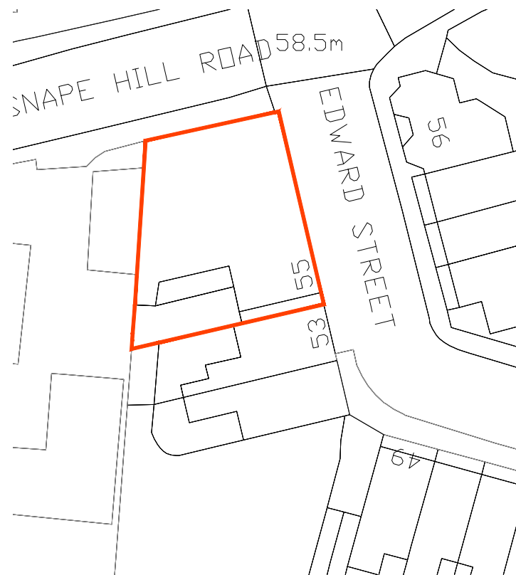
SITE-LOCATION PLAN SCALE 1:500@A3