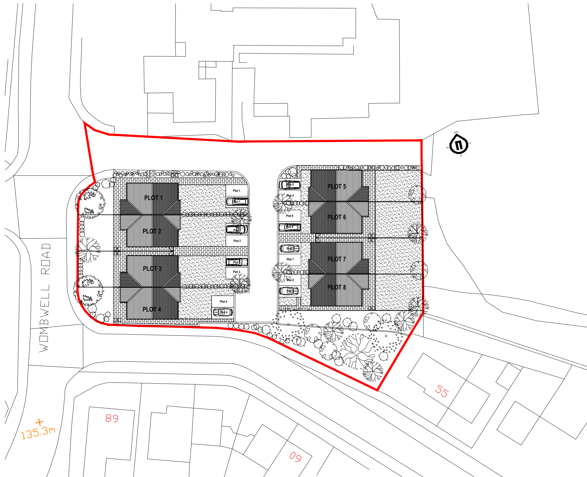
PROPOSED SITE PLAN 1:500 @A3