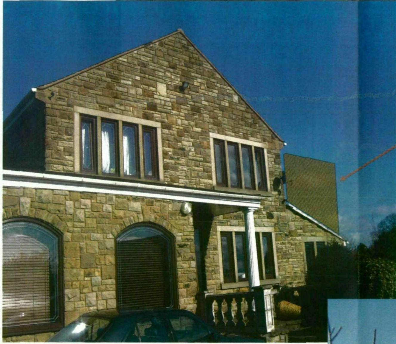
Photographs of existing building at front elevation and East Elevation with outline of extension Highlighted.

Proposed Extension over existing single storey section of Building