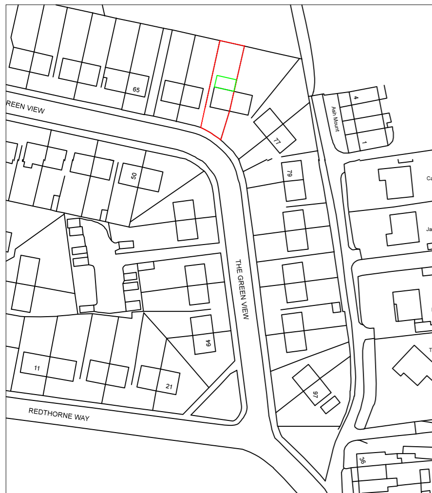
LOCATION PLAN SCALE 1:1250 AT A3