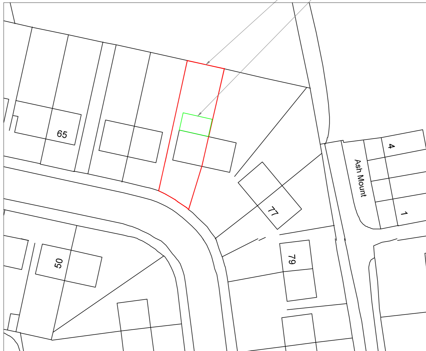
SITE PLAN SCALE 1:500 AT A3