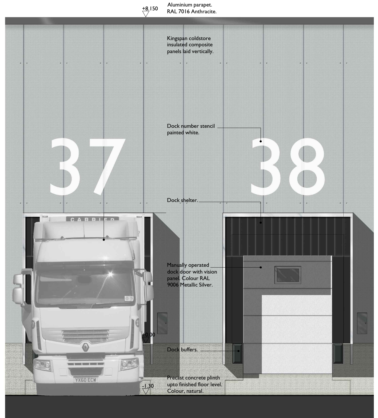
AMBIENT WAREHOUSE - WEST ELEVATION

DALKIN SCOTTON PARTNERSHIP ARCHITECTS LIMITED