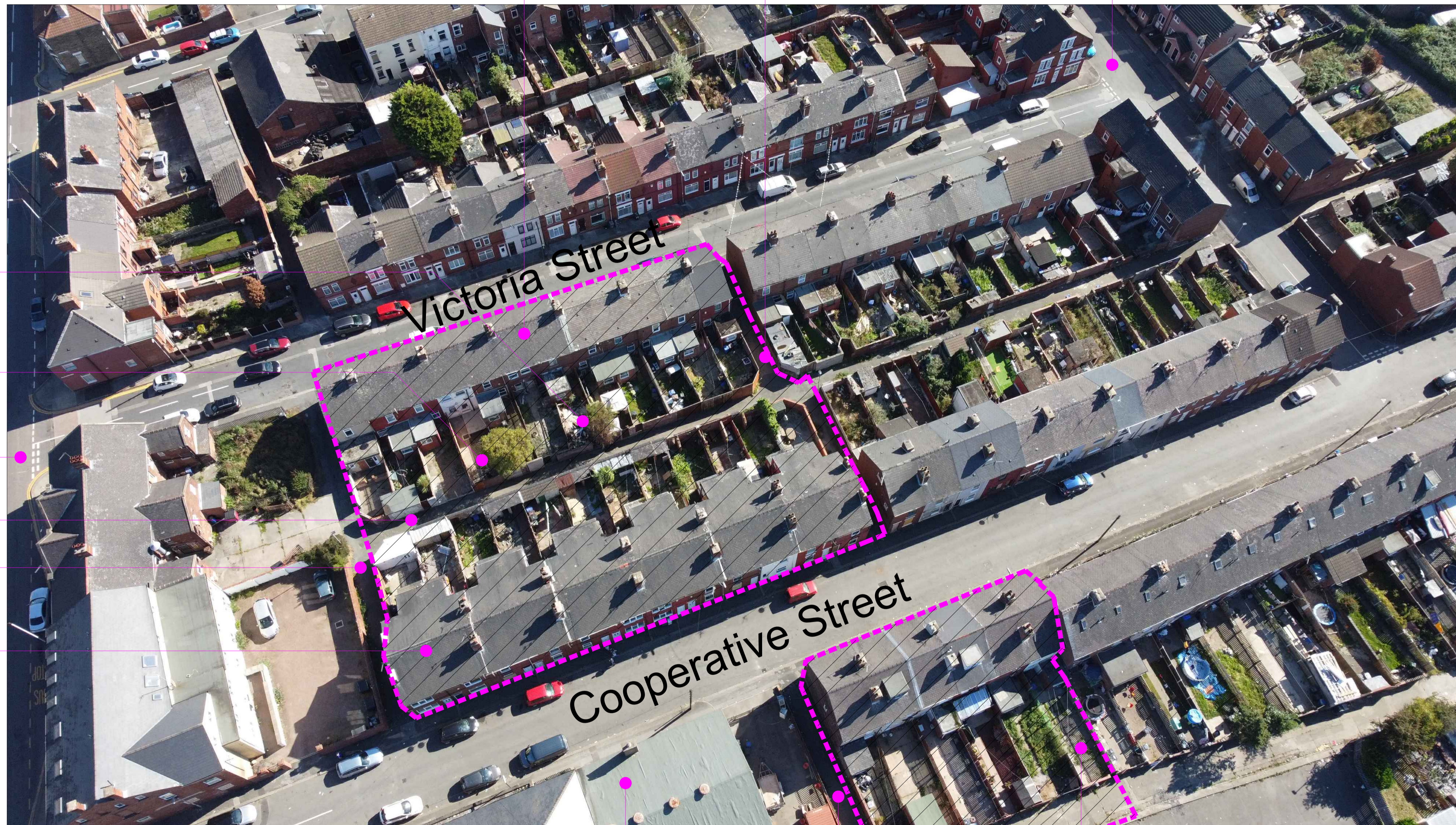
Drone Photo 1

Note: T2 & T3 are existing small urban trees (Elder) within rear gardens to Plots 12 & 16 Victoria Street. These trees cannot be accommodated in their existing location on the proposed site layout so are to be removed as part of the demolition works. New trees of suitable species and size will be provided in the new public open green spaces as part of the new build & public realm / landscaping works.