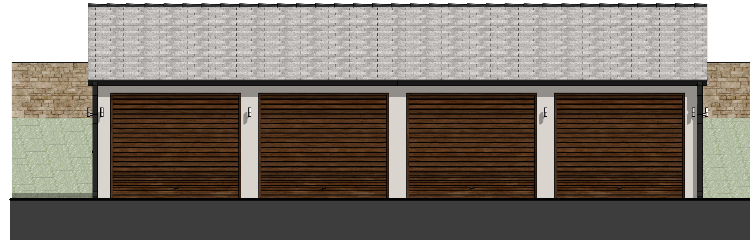
Garage - Front Elevation