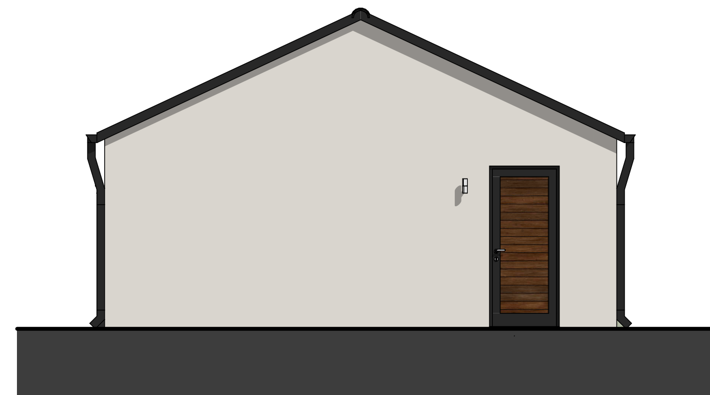
Garage - Side Elevation