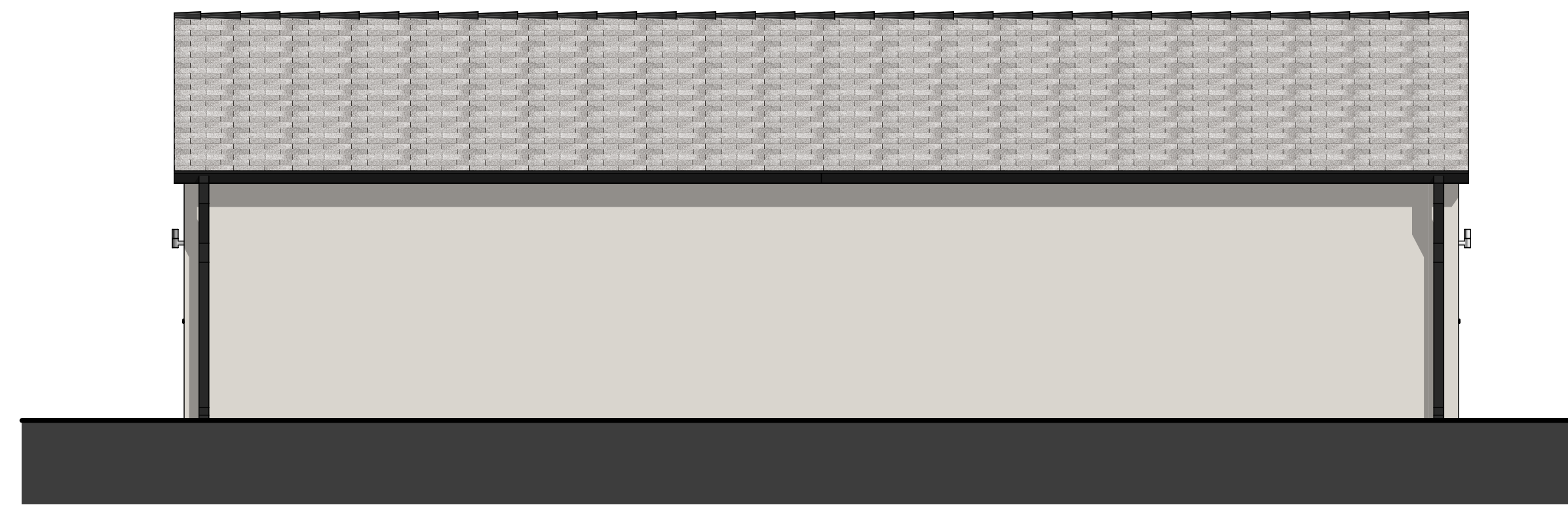
Garage - Rear Elevation