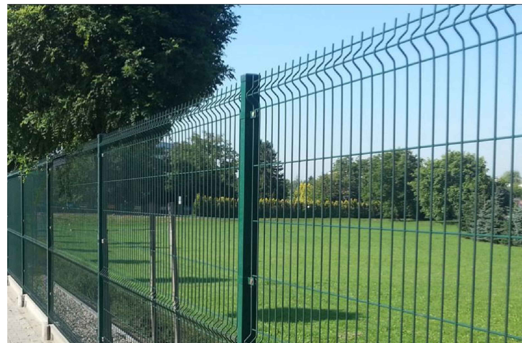
TYPICAL EXAMPLES OF FENCING 2.7M HIGH