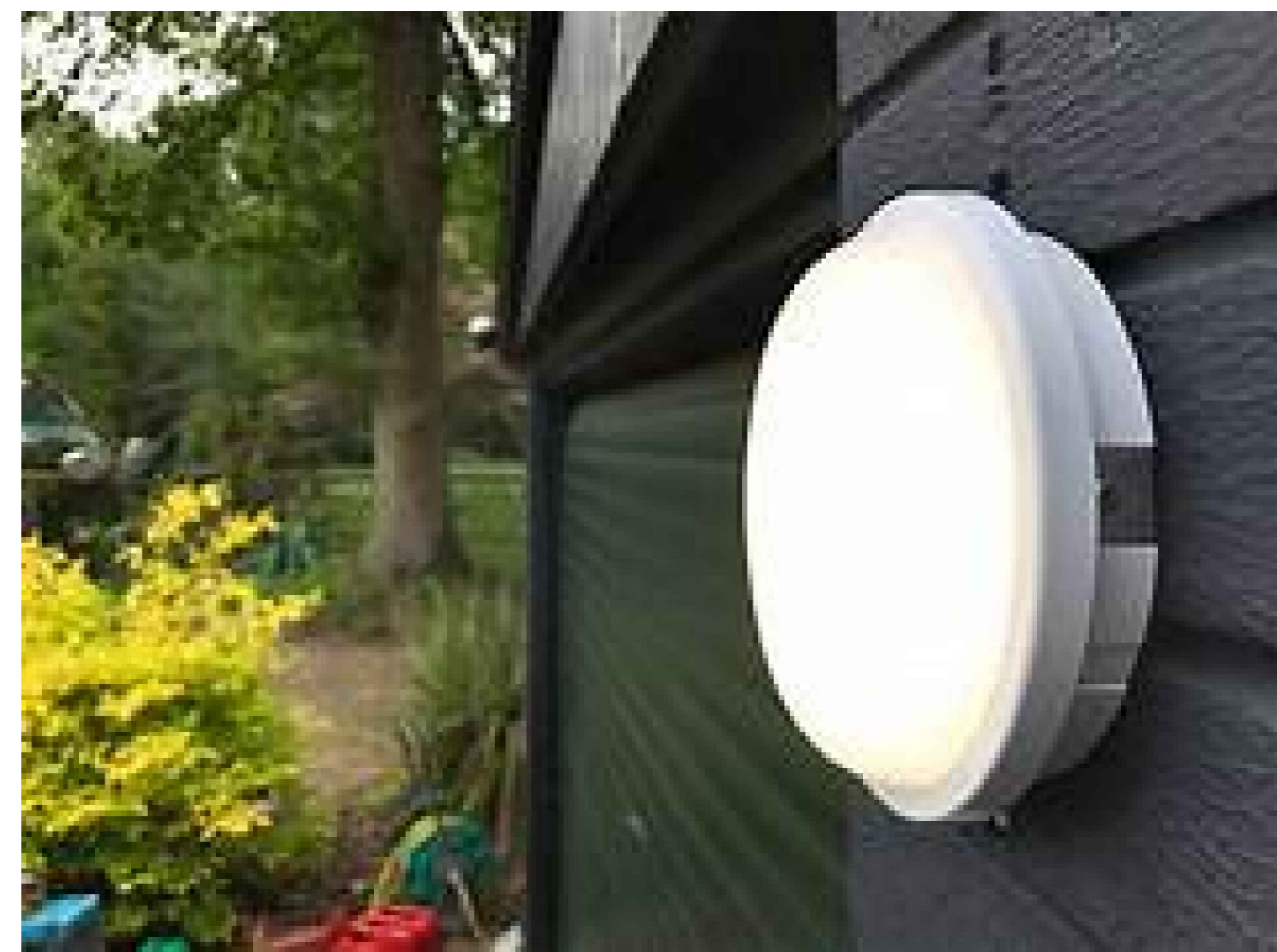
WALL MOUNTED PIR PHOTOCCELL CONTROL