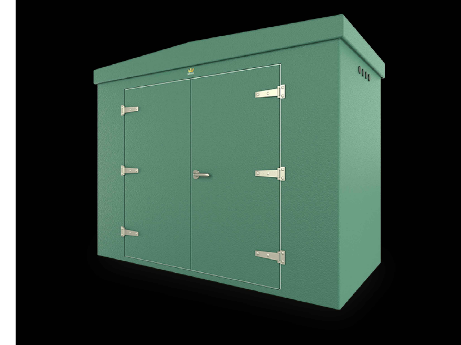
GRP KIOSK 2M X 2M X 2.5M (RAL 6005)