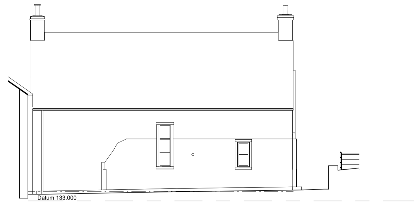
north-west 1 : 100