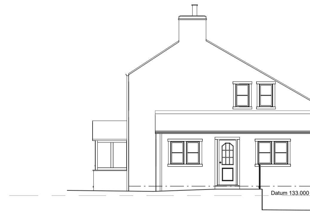
north-east 1 : 100