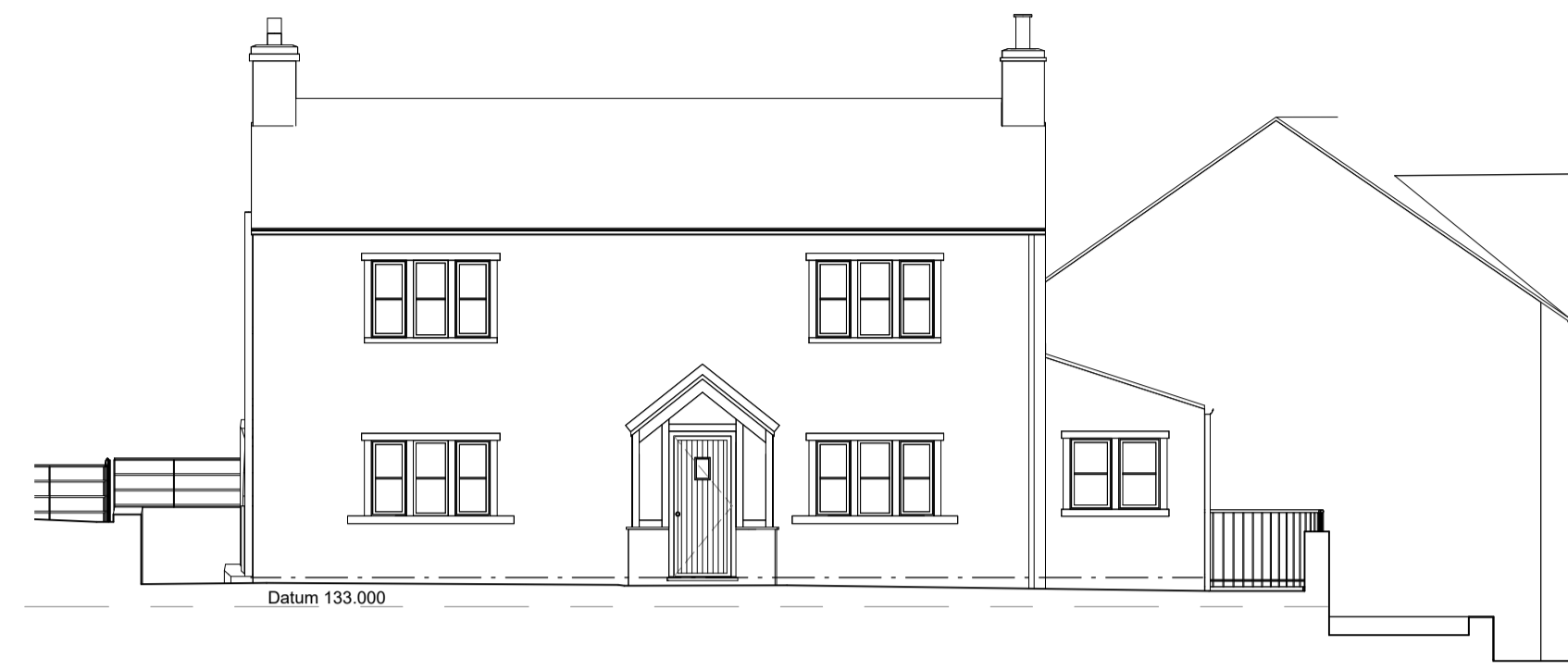
south-east 1 : 100