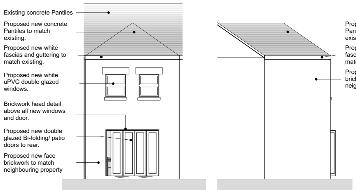
PROPOSED REAR 1:100 SIDE ELEVATION 1:100