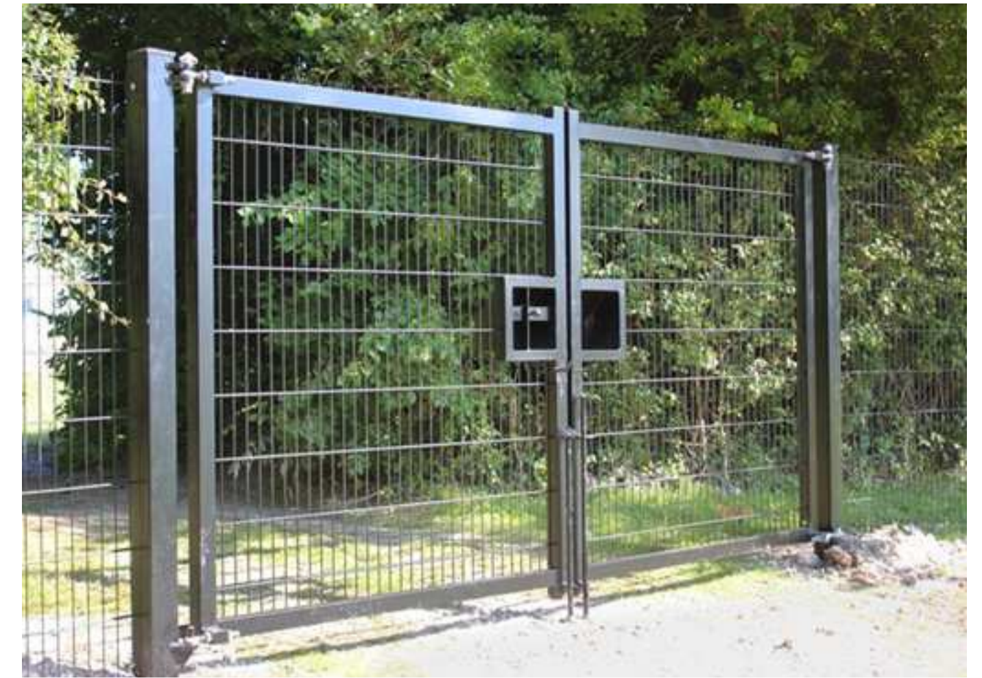
Example Image of Proposed Double Leaf Gate, Black (RAL 9005)