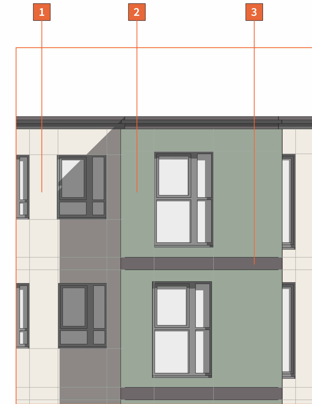
2 Proposed Elevation - Materials Key 1:50

NB: DASHED LINES DENOTE LINING THROUGH OF HORIZONTAL CLADDING TO OMIT IRREGULAR CUTTING OF PANELS.