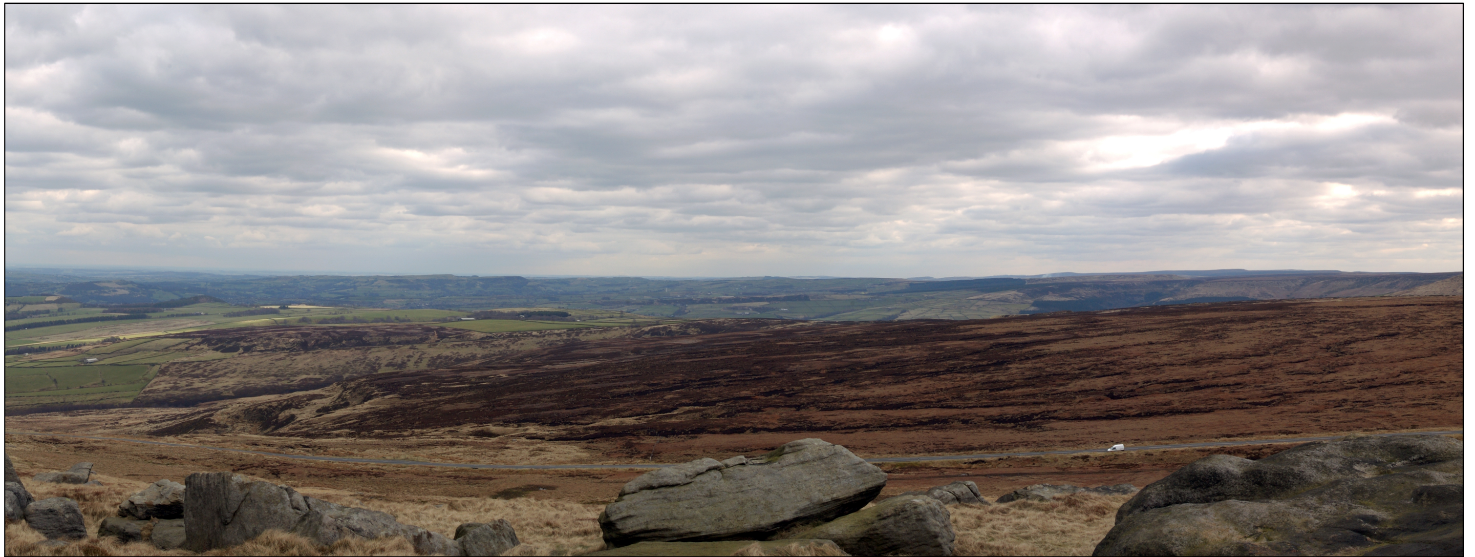
Existing view from viewpoint