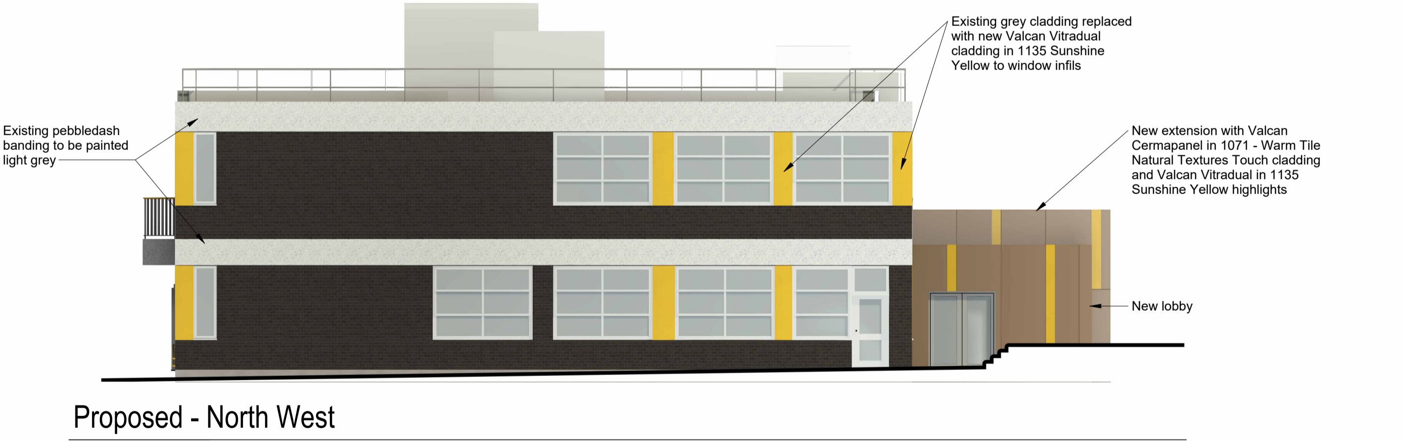
Proposed - North West