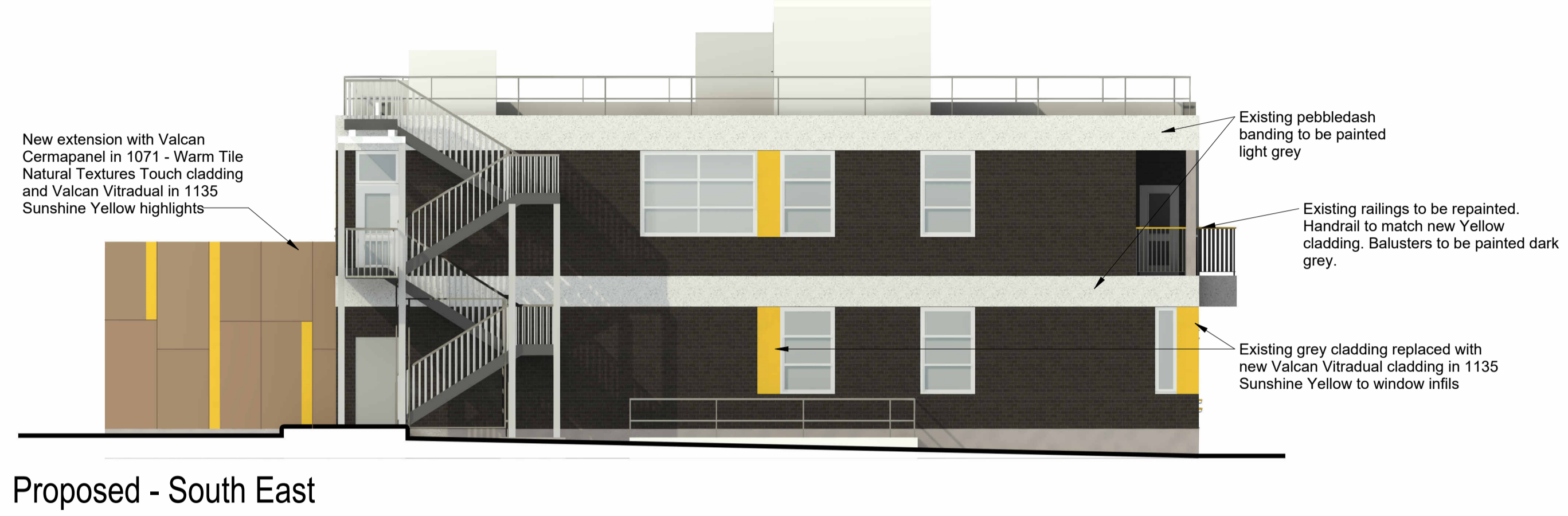
Proposed - South East