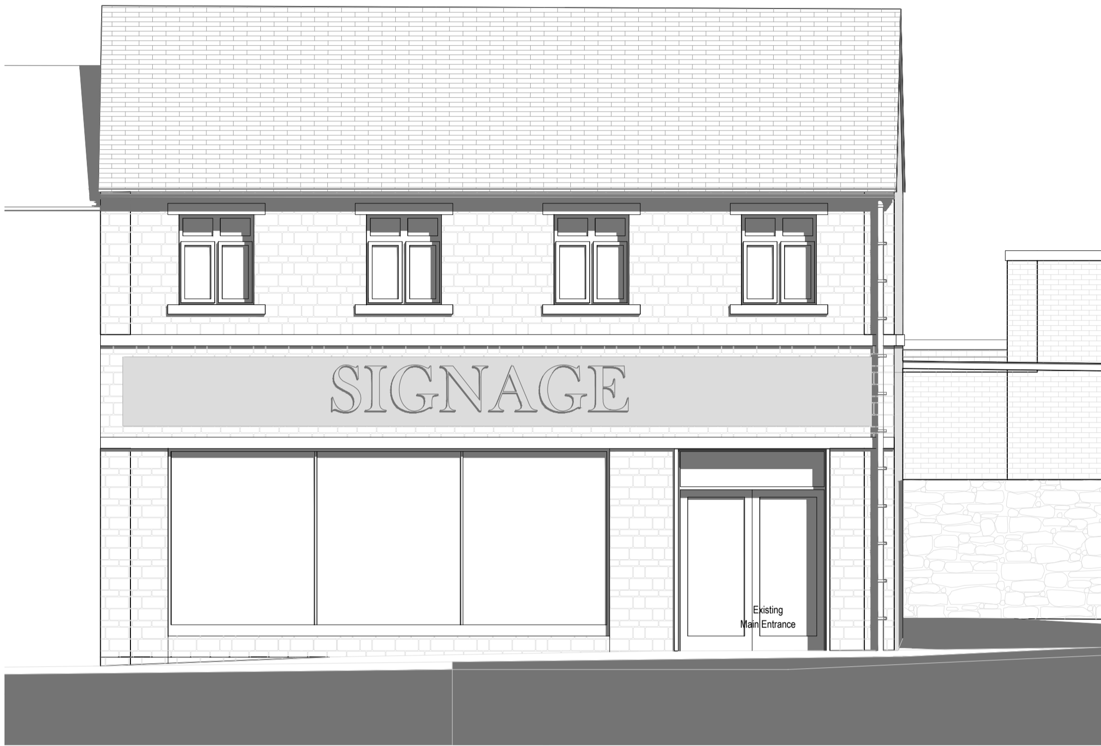
Existing Front Elevation Scale 1:50