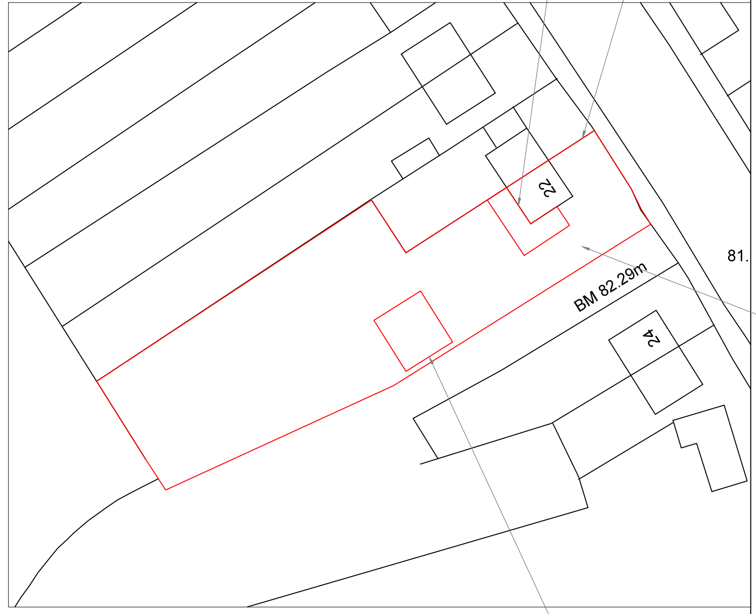
SITE PLAN SCALE 1:500 AT A3

NEW ACCESS DRIVE TO BE PAVED IN PERMEABLE MATERIAL