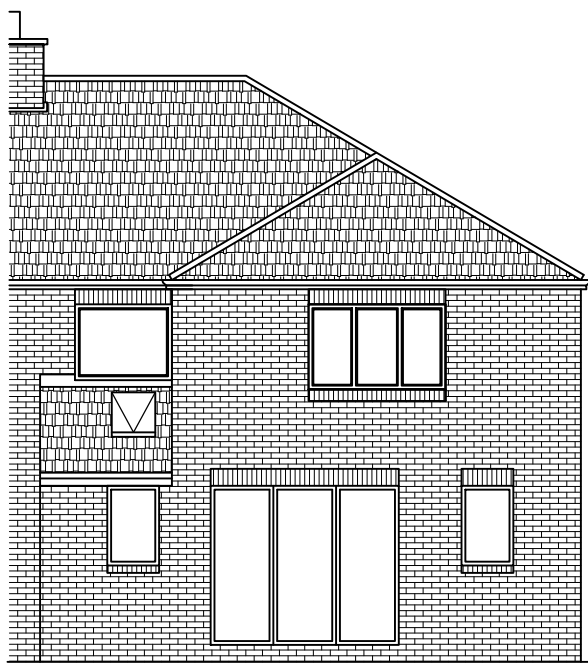
PROPOSED REAR ELEVATION SCALE 1:100 AT A3