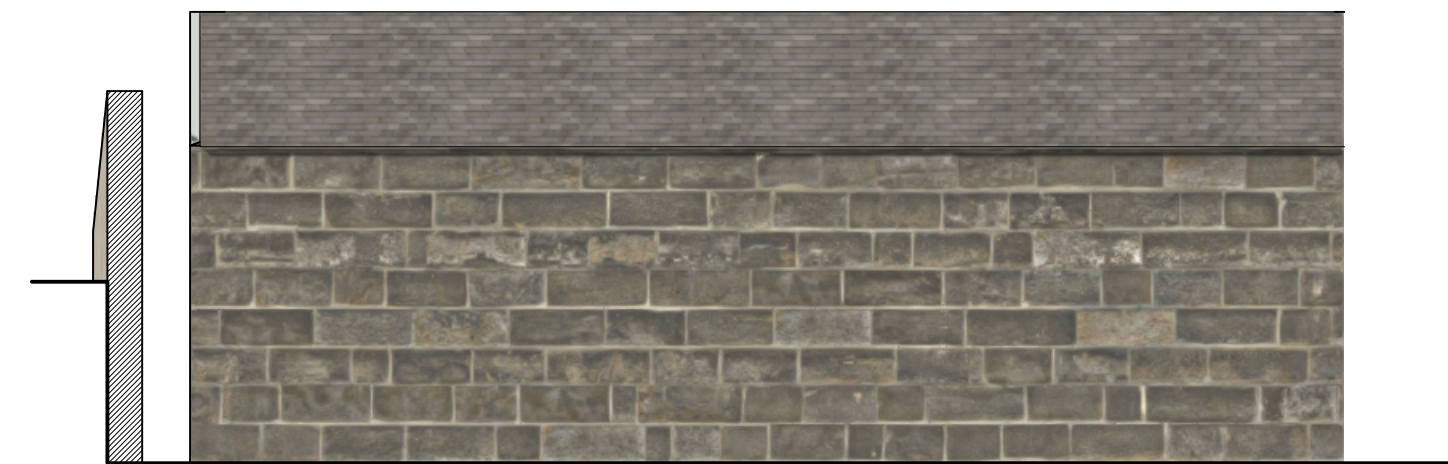
3 Proposed Rear Elevation Scale: 1:50