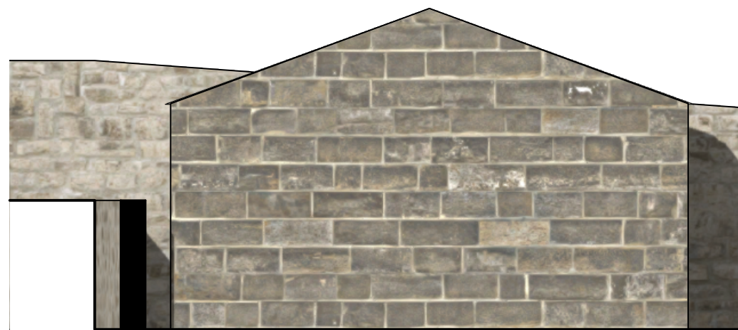
4 Proposed Side Elevation (Garden Side) Scale: 1:50