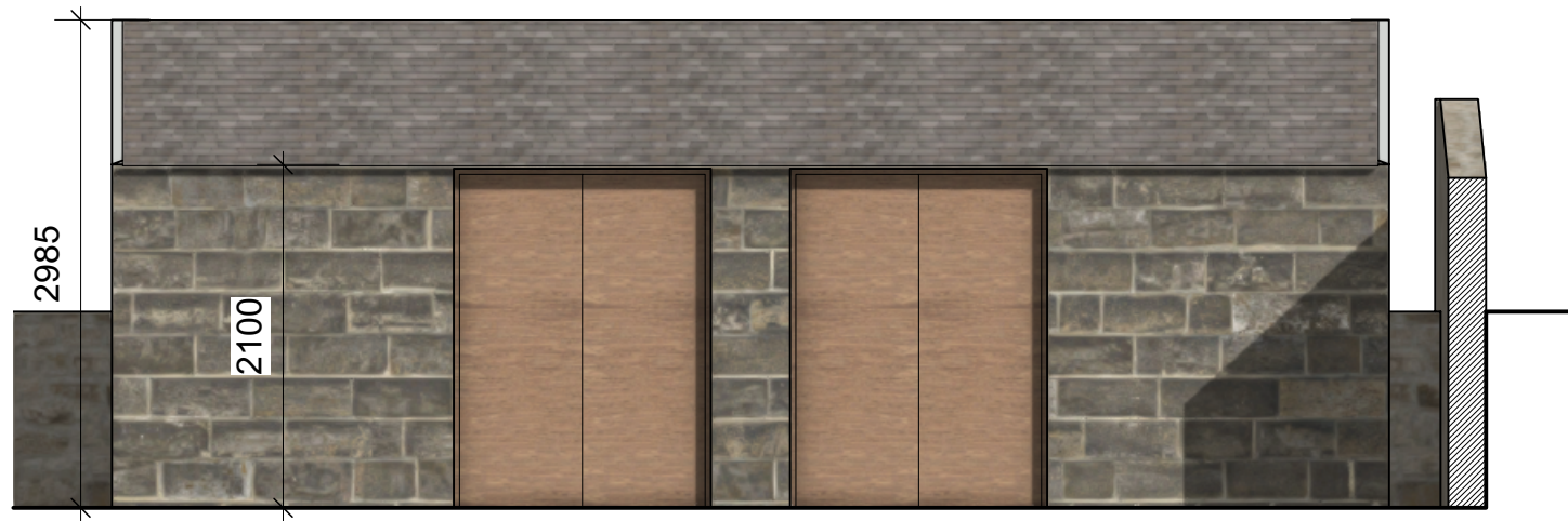
1 Proposed Front Elevation Scale: 1:50