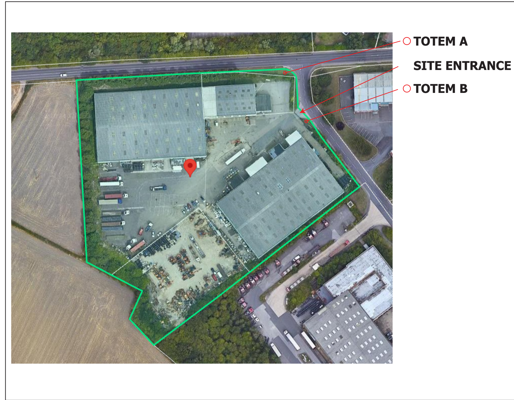
TOTEM A NOT TO SCALE (FOR VISUAL PURPOSES ONLY)