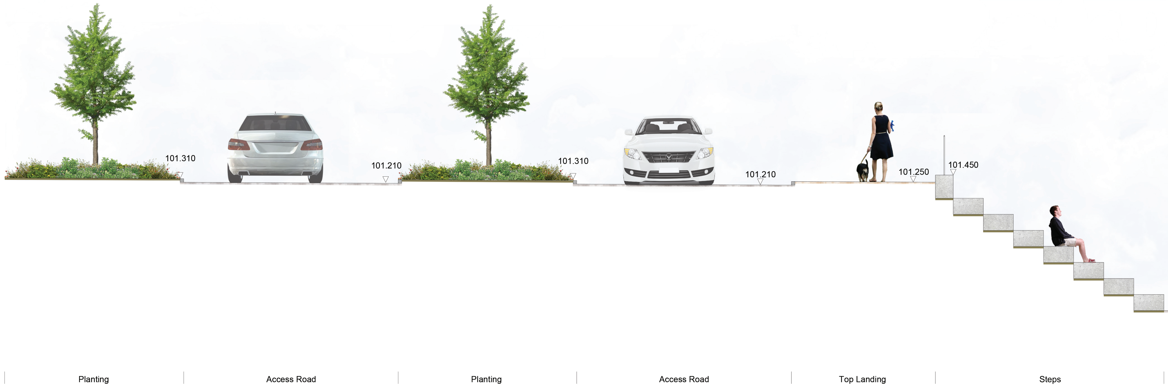
D-D Western Gateway 1:50