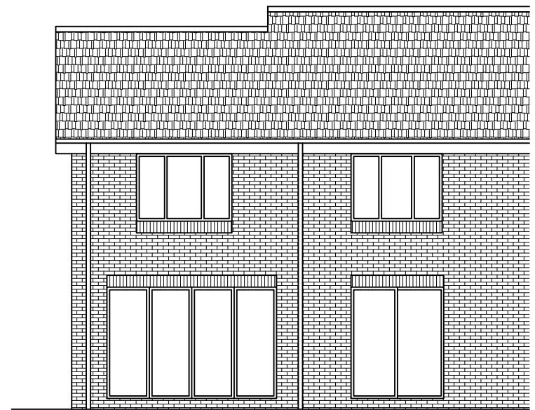
PROPOSED REAR ELEVATION SCALE 1:100 AT A3