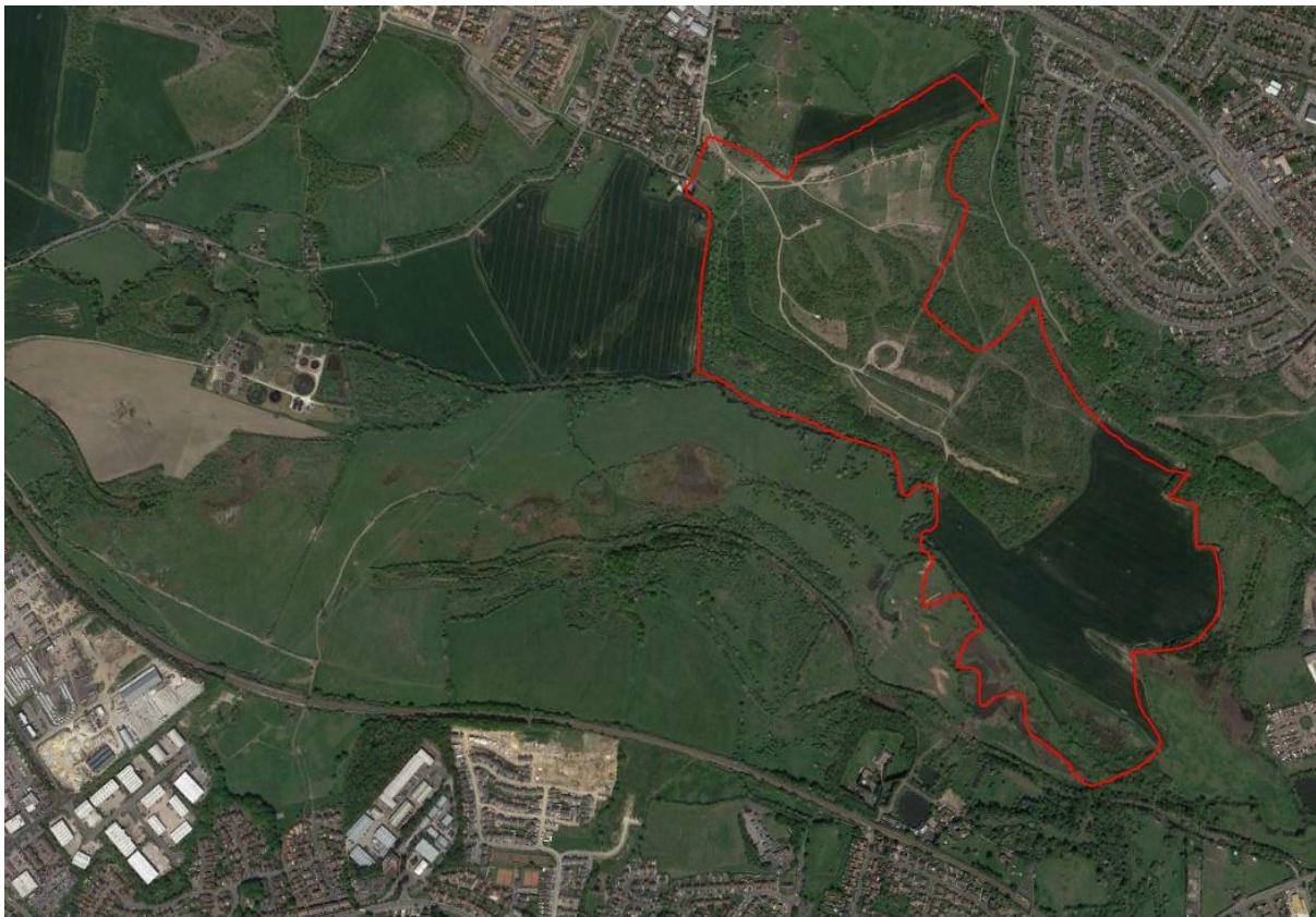
Figure 1. Showing approx site boundary

The site comprises several paddocks and stabling for horses and open grassland interspersed with woodland.