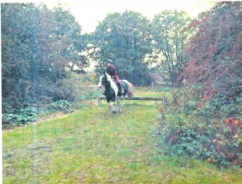
Figure 4 EQUESTRIAN EVENT