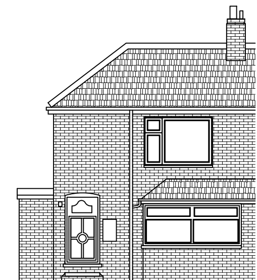
EXISTING FRONT ELEVATION SCALE 1:100 AT A3