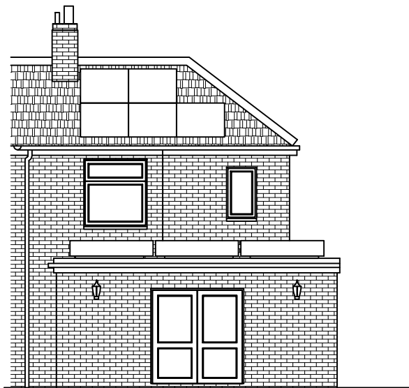
EXISTING REAR ELEVATION SCALE 1:100 AT A3