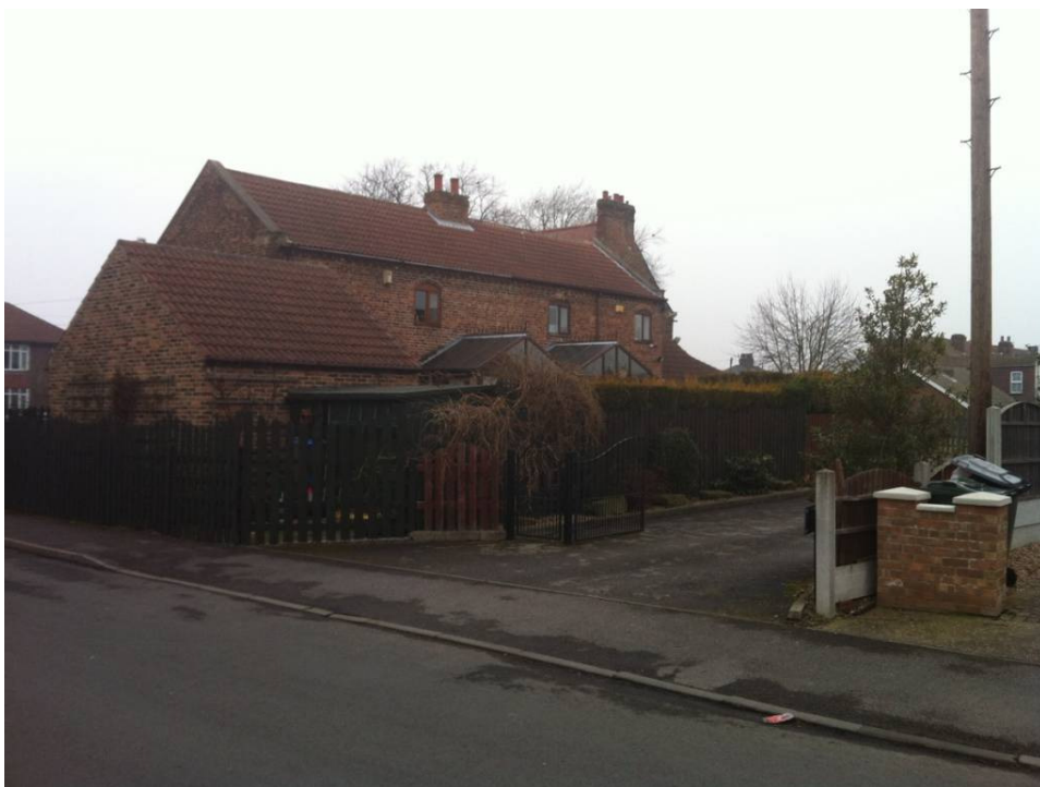
4. South East elevation taken from Hall Farm Drive.