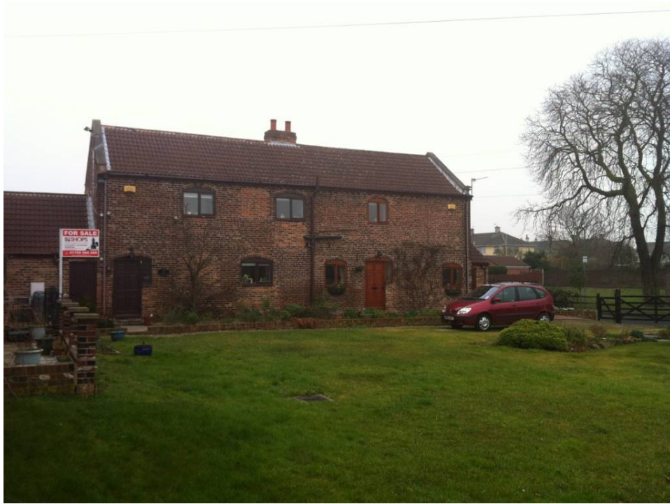
5. North West elevation of converted barn viewed from Shepherd lane