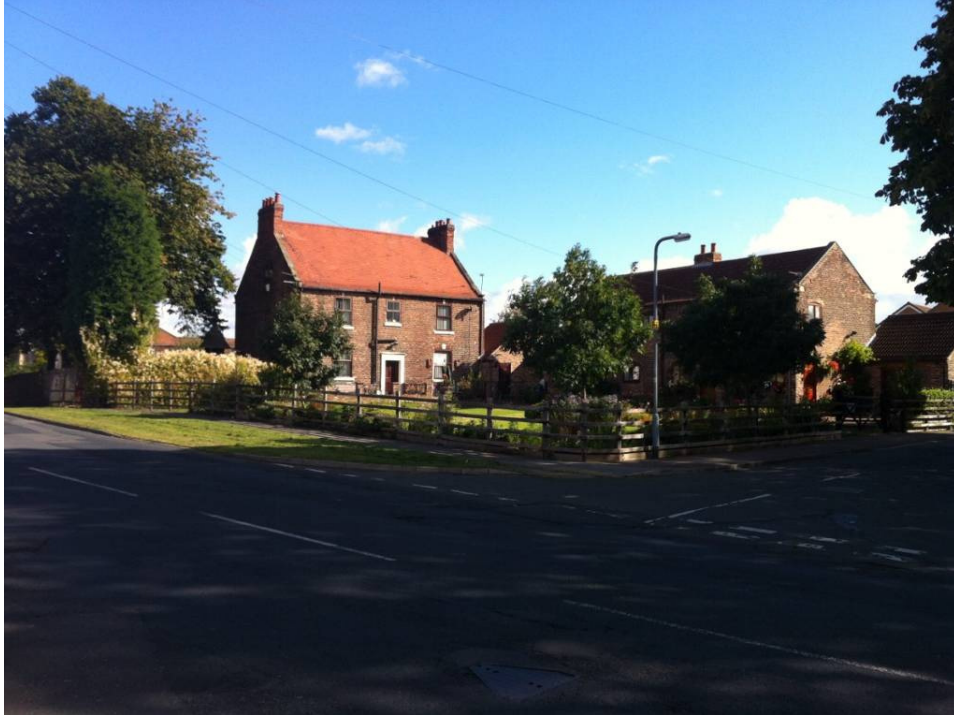
1. View of Hall Farm from junction of Shepherd Lane and Hall Farm Drive