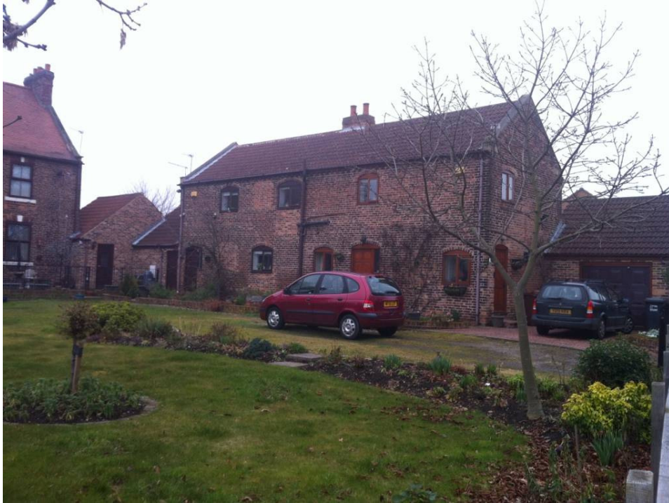
3. North West elevation of barn conversion.