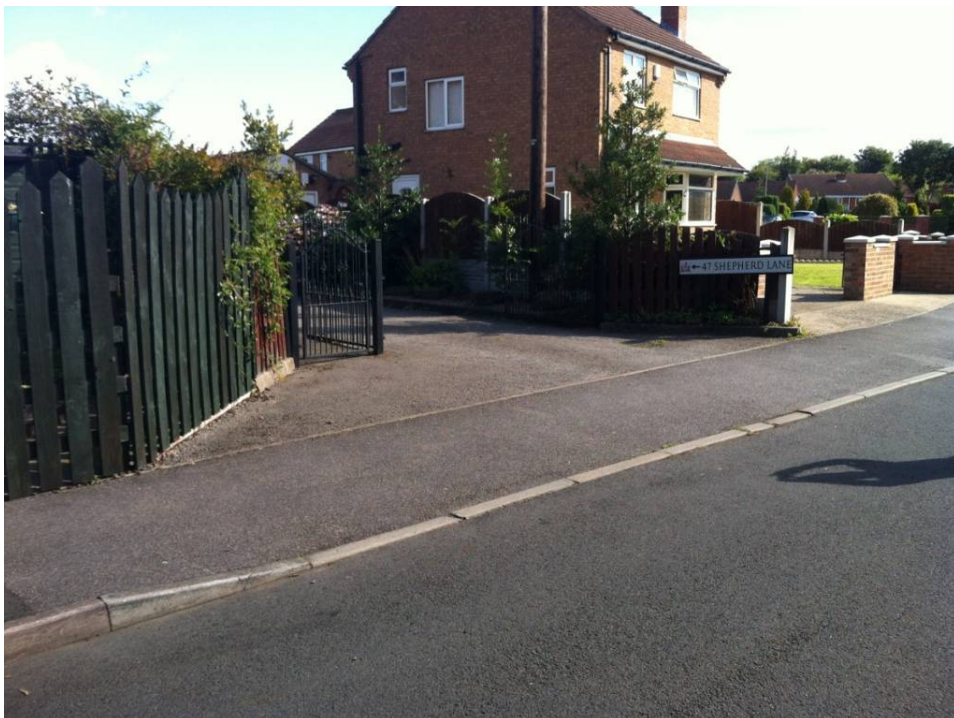
2. View of rear access from Hall Farm Drive