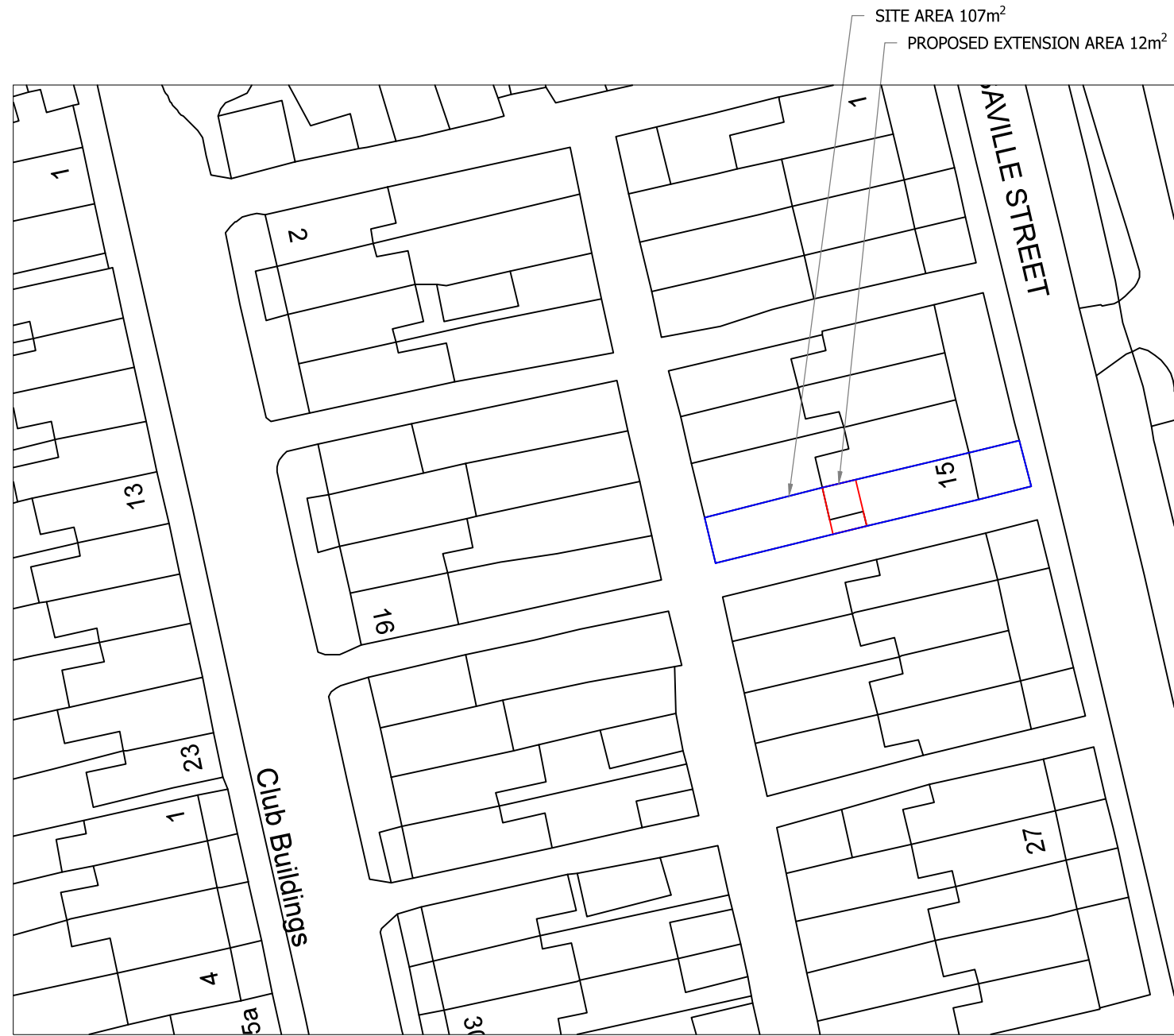
SITE PLAN SCALE 1:500 AT A3