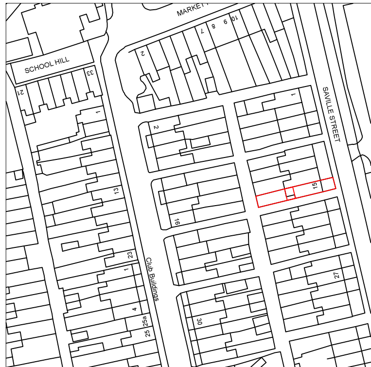
LOCATION PLAN SCALE 1:1250 AT A3