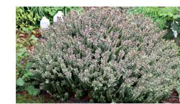
Hebe albicans 'Red Edge'