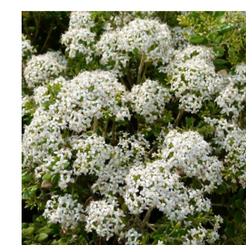
Olearia x haastii

BIRD BOXES Schwegler 1B Bird Boxes - Olive Green