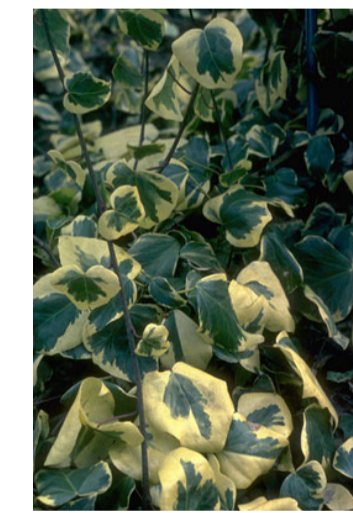
Hedera colchica 'Dentata Variegata'