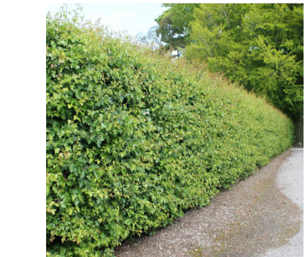
Crataegus monogyna; Corylus avellana

GENERAL NOTES: 1. DO NOT SCALE FROM THIS DRAWING. DIMENSIONS GOVERN. 2. ALL DIMENSIONS ARE IN MILLIMETRES UNLESS NOTED OTHERWISE. 3. ALL DIMENSIONS SHALL BE VERIFIED ON SITE BEFORE PROCEEDING WITH THE WORK. 4. PLINCKE SHALL BE NOTIFIED IN WRITING OF ANY DISCREPANCIES. 5. PLINCKE ACCEPTS NO LIABILITY FOR ANY EXPENSE LOSS OR DAMAGE OF WHATSOEVER NATURE AND HOWEVER ARISING FROM ANY VARIATION MADE TO THIS DRAWING OR IN THE EXECUTION OF THE WORK TO WHICH IT RELATED WHICH HAS NOT BEEN REFERRED TO THEM AND PRIOR APPROVAL OBTAINED.