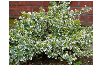
Euonymus fortunei 'Emerald Gaiety'