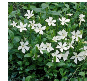
Vinca minor alba

2L/3L CONTAINERS PLANTED AT 3-4 PLANTS PER M2 -MIXTURE OF GROUND COVER AND FEATURE PLANTS