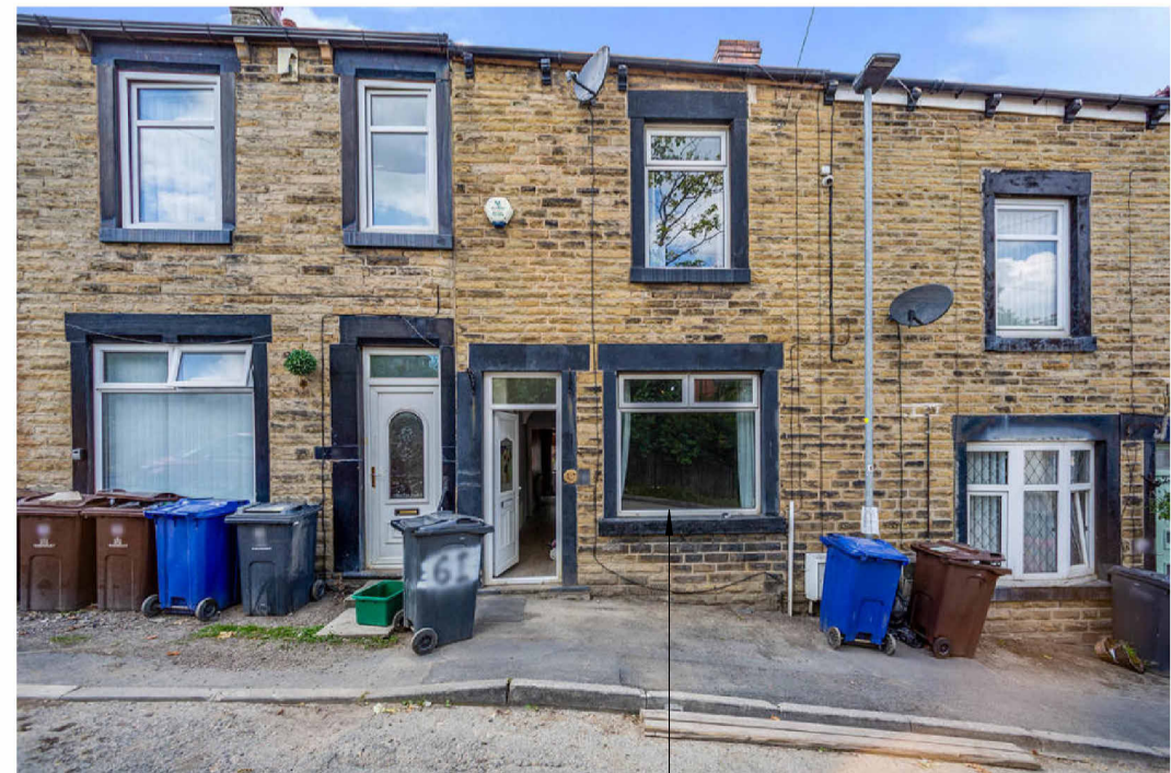
Stone window surrounds