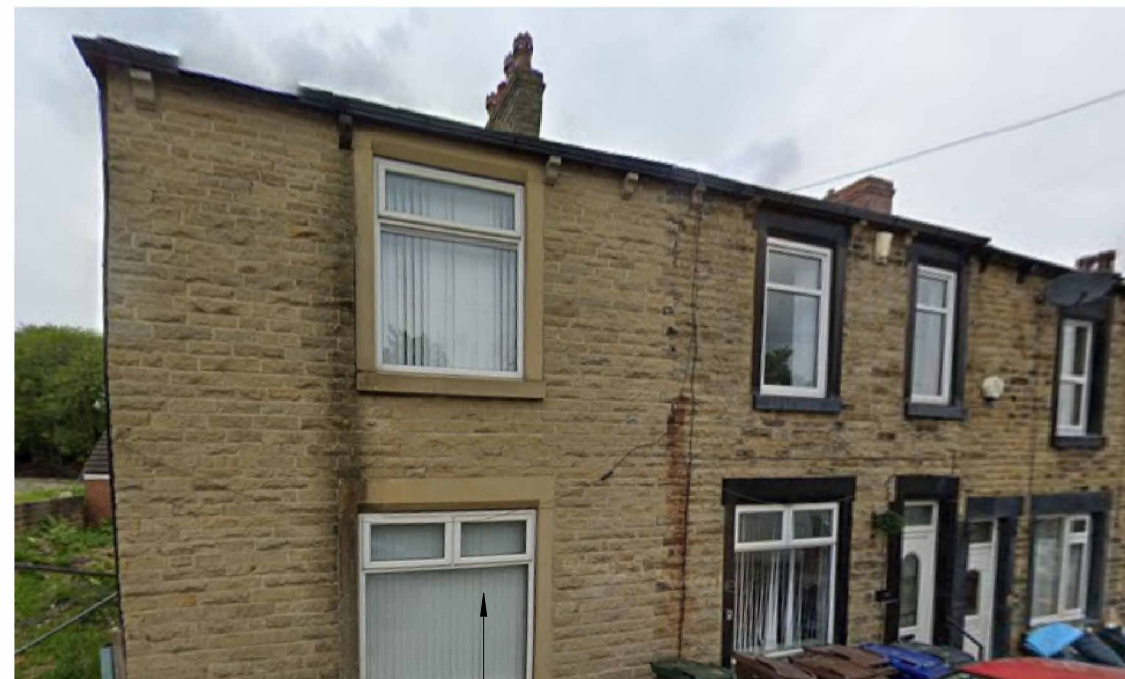
No 63 opposite the proposed dwelling with side extension to form double fronted dwelling, stone window surrounds.