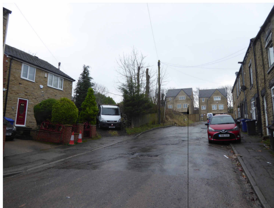
Tower Street town houses with modern window configurations