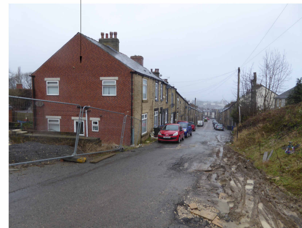
Red brick gable visible to street scene