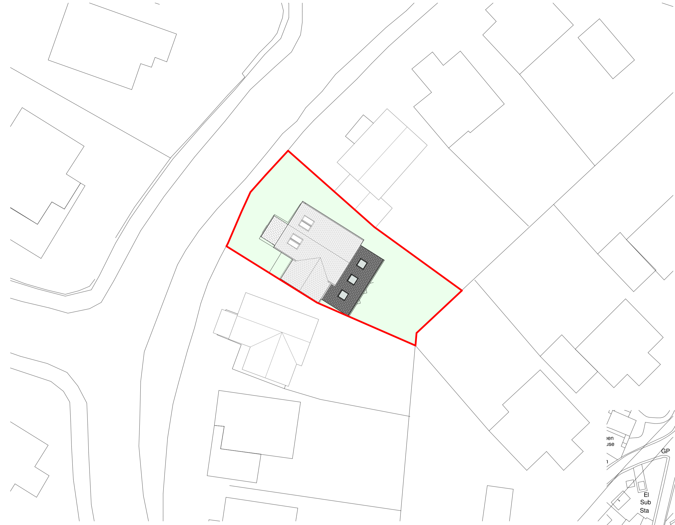
Site / Block Plan 1 : 200