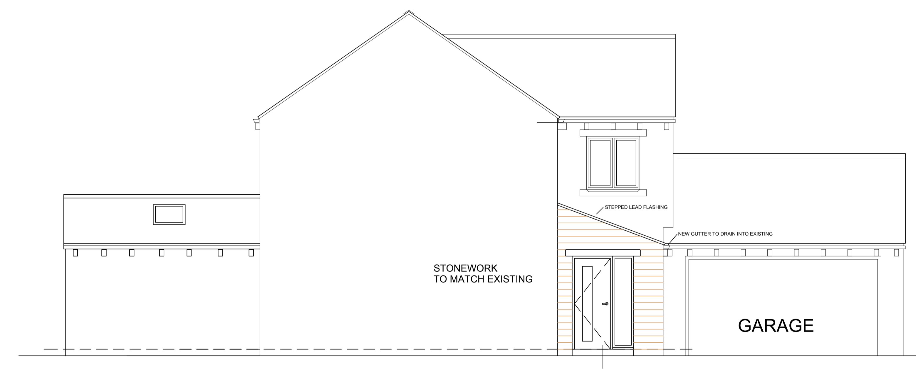
SIDE ELEVATION - LEFT