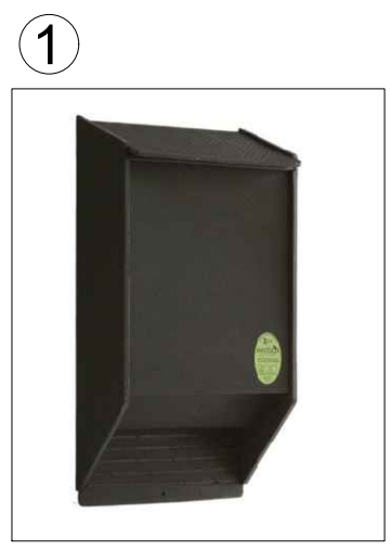
Bat Box Wildcare Eco Crevice / Cavity Bat Box To be hung at a minimum height of 3m facing between the south or southwest.