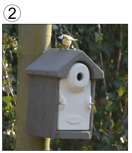
Bird Box Vivara Pro Seville 28mm Woodstone Nest Box Pole Mounted at a minimum height of 2m facing between northeast and southeast

IMPLEMENTATION PROGRAMME: First planting season following construction LANDSCAPE MANAGEMENT: Site Owner to implement 5-year management plan to cover the following regular, seasonal and annual maintenance operations: Trees: Water monthly April to September in periods of drought Inspect trees annually in winter Undertake formative pruning of young trees to encourage good growth and shape - As required. Following strong winds, re-firm base and check tree stakes for stability. - As required Check tree ties on new tree planting and replace/loosen/remove as necessary Apply slow release fertiliser to base of each tree; 50g per new tree. - Annual, Mar-Apr Shrubs: Remove litter Water monthly April to September in periods of drought Maintain plant beds weed free Remove dead plants Trim planting to prevent encroachment onto paths Prune planting clear of all signage and sightlines Prune beech hedges once annually Firm up rocked plants Eradicate any occurrence of Japanese Knotweed Meadow Grass Cut twice annually in spring and autumn Remove litter Plant failures Replace any dead plants in following planting season (Nov - Mar).